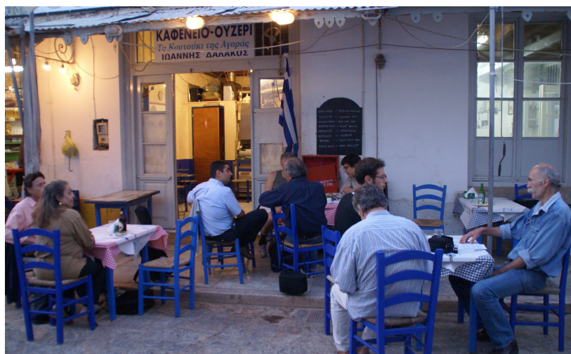
Fig. 5: Our favourite koutouki in Hydra market. Later it was closed because they said it was being used as a brothel.