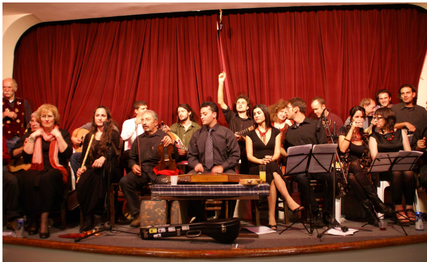
Fig. 2: We bring 20+ musicians to Ertho Theatre to play for the Greeks of Istanbul.