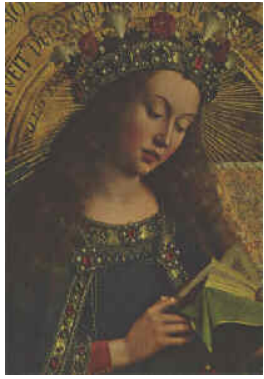
Image: Jan van Eyck, Ghent Altarpiece, excerpt, 1432

she consents to become Mother of the Savior, the forecasts become reality.