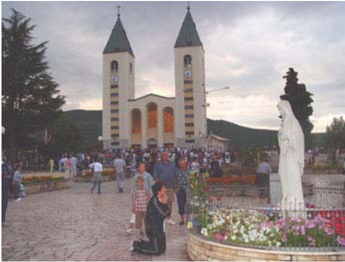
(Published by: Information Center MIR - Shrine of the Queen of Peace, 88266 Medjugorje. http://www.medjugorje.hr/ulazakenstipe.htm )