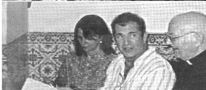
Gibson and wife meet Lucia.