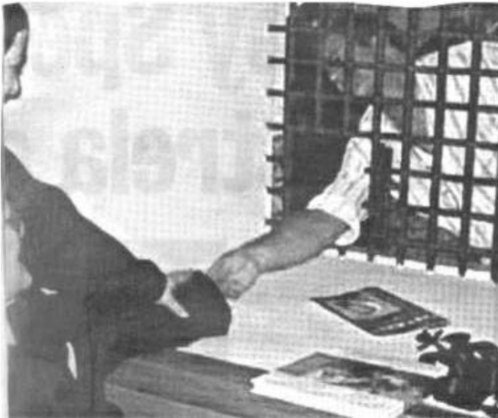
Gibson Shakes Hands with Lucia.