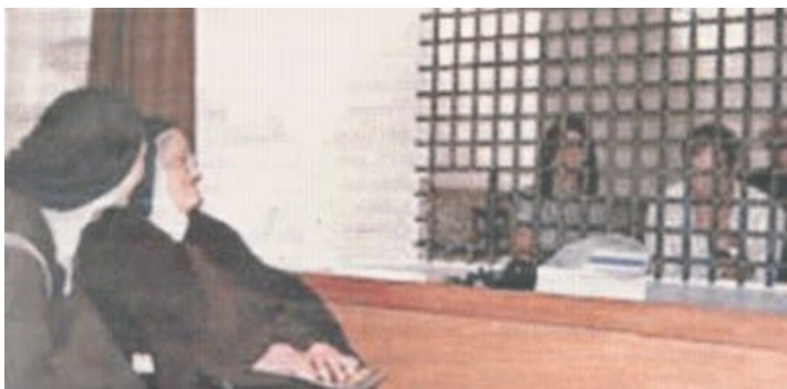
Sisters Sophia and Lucia, Mel Gibson and wife.

Actor Mel Gibson held a secret meeting with one of the famous visionaries of Fatima, Sister Lucia of Portugal.