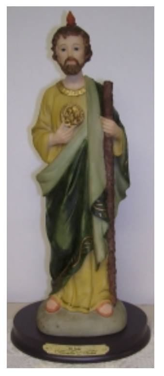
Saint Anthony of Padua 8" $24.95, 12" $39.95

Saint Francis of Assisi 8" $24.95, 12" $39.95