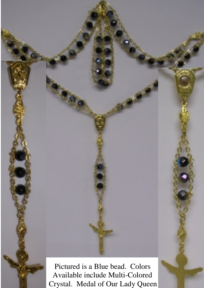
of Peace contains a vial of dirt from Podbrdo (Apparition) Hill

Lady Queen of Peace contains a vial of dirt from Podbrdo (Apparition) Hill.