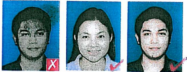
Photo should be free from ink marks, dirt, grease, fingerprints and paste stains. DO NOT USE ERASER/APPLY CHEMICAL ON THE PHOTO TO CLEAN IT.