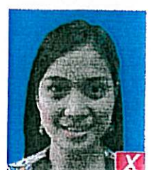
Uneven skin color