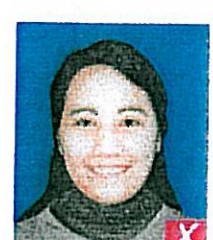
Yellowish Skin tone