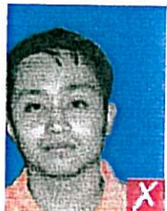
Facial image not centered