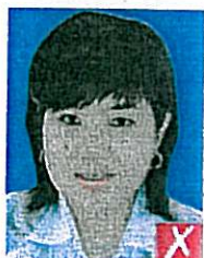
Hair across the eyebrow area