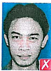
Image of face is too big