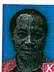
Eye and neck area too dark. (white of eyes not visible)