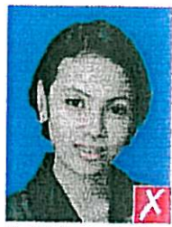
Facial image is tilted