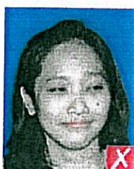
Not looking directly at the camera