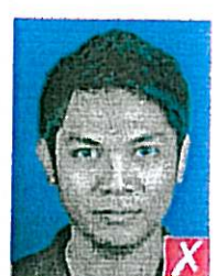
Unnatural skin tone