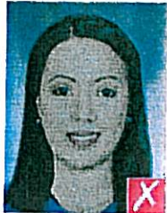
Wrong color of background