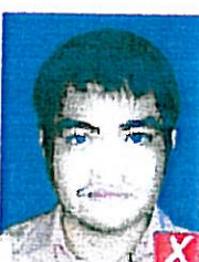
Flash too strong