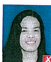
Ears not shown