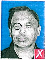
Photo with Red Eye Effect