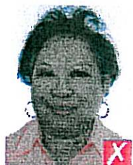
Wrong color of background Earrings too big