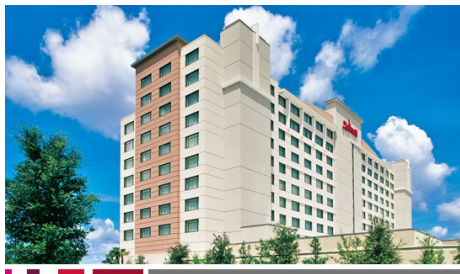
Marriott Orlando Lake Mary Hotel