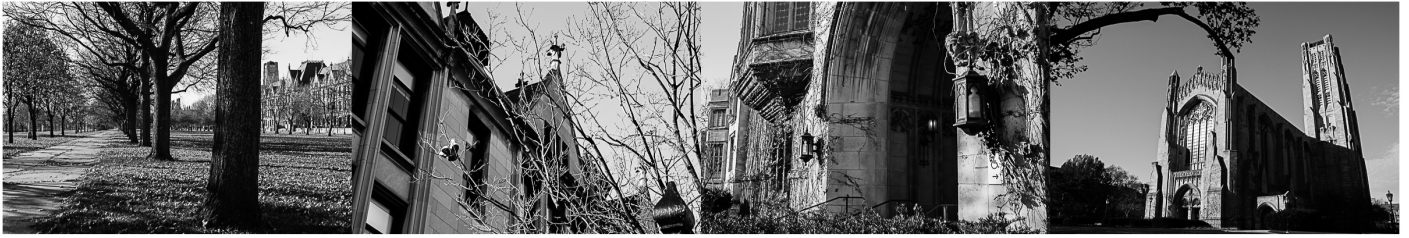
1/250 sec at f / 11