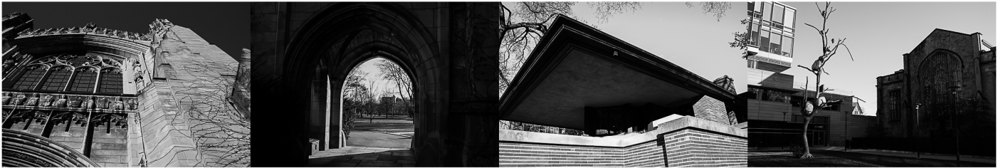
1/400 sec at f / 14