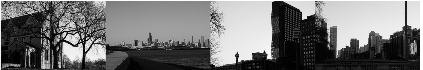
1/200 sec at f / 11