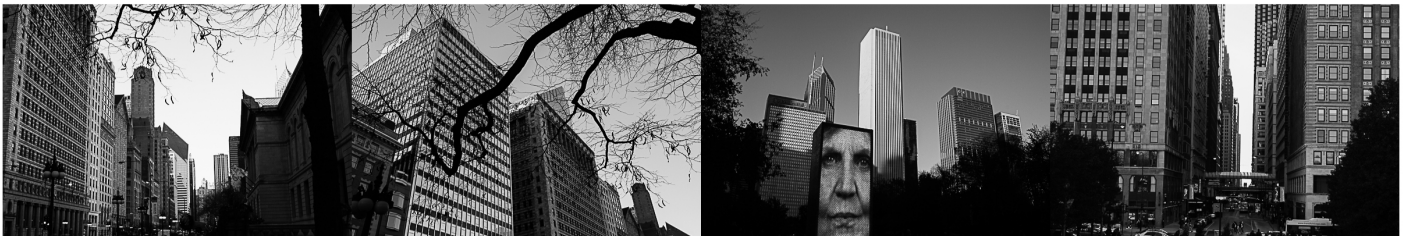
1/250 sec at f / 11