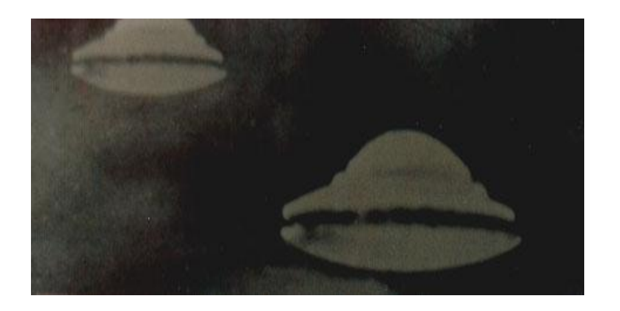
Fig. #1 (T1 z [1/5]): Shown above is a photograph which provides an illustrative evidence that time travel is possible. Originally the above photograph is presented as Figure T1 from monograph [1/5], and as Figure K4 in monograph [1e]. It managed to capture one and the same UFO vehicle of K7 type, which, however, was photographed as being present simultaneously in two different areas of space at the same moment of time. Even if we ignore the principle on which this UFO vehicle moves, and which still even today remains a mystery for orthodox science, the sole fact that it is present simultaneously in two different areas of space, is a perfect example when the reality contradicts the claims of human orthodox scientists. (Notice, that the principle of motion of this UFO vehicle is already explained by the totaliztic science based on the Concept of Dipolar Gravity. This science explains that the motion of this UFO is carried out on the principles of the technical telekinesis - which is a technical version of human psychokinesis.) After all, orthodox human scientists claim that the same object is unable to be present in two places at the same time. Thus, the above photograph documents illustratively that orthodox scientists are at wrong regarding matters of time travel, and that people should not take too seriously what present scientists are stating on this subject, because their knowledge is still very far in the cave age. (Especially, when their claims are negative and try to convince people that something is impossible - after all the philosophy of totalizm reasoned that our universe is build in such a manner, that "everything is possible

We all perfectly know the proverb that "all roads lead to Rome". The attribute of this proverb is, that it is still going to remain true when we modify it into the form which states that "if several roads leads to Rome, than this means that Rome actually does exist and can be reached by us". Expressing this in other words, if three separate groups of premises indicate that time vehicles are feasible and can be build, and even someone already now uses them on the Earth, we should not treat too serious claims of scientists who try to convince us to something completely opposite. After all, we know what <a href="evil">evil</a> forces hide behind backs of such scientists. Not mentioning that scientists are already famous through the ages from the fact that they are constantly wrong and that they repetitively are forced to deny whatever they stated shortly before.