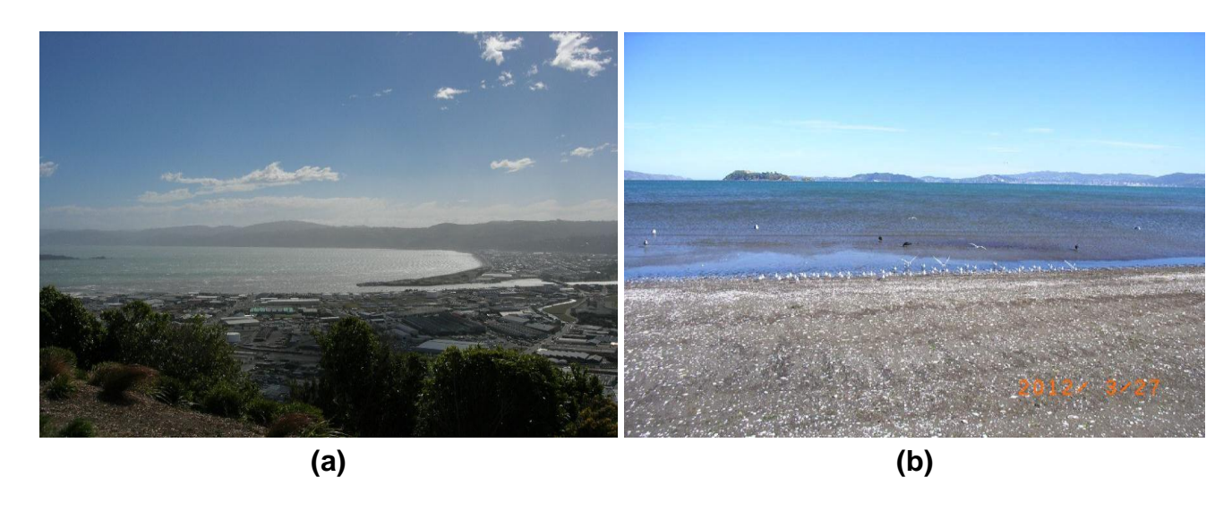
Fig. #B1ab: Sights of the township of Petone from the suburb of Wellington, New Zealand. These photographs illustrate a typical appearance of the township in a nice day. Unfortunately, lately nice days appear rather rarely in the capitol Wellington, which in New Zealand is known as a "windy city". In turn because Petone is in close proximity to usually cloudy and wind-

Similarly as in nearly all of New Zealand, also in Petone everything works on the principle of "old boys networks". After all, almost everyone here knows everyone else - sometimes even for several generations. Also each one calls here others by their Christian name. Since being the creator of totalizm and the researcher of philosophical trends, it is for me highly interesting to compare the work of mechanisms of life in Petone, with mechanisms that I still remember from the Polish village <u>Cielcza</u> - in which also everything was handled on the similar basis of "everyone knowing everyone". The reason why this induces such my curiosity is that both these human settlements are occupying almost opposite ends of the moral spectrum.