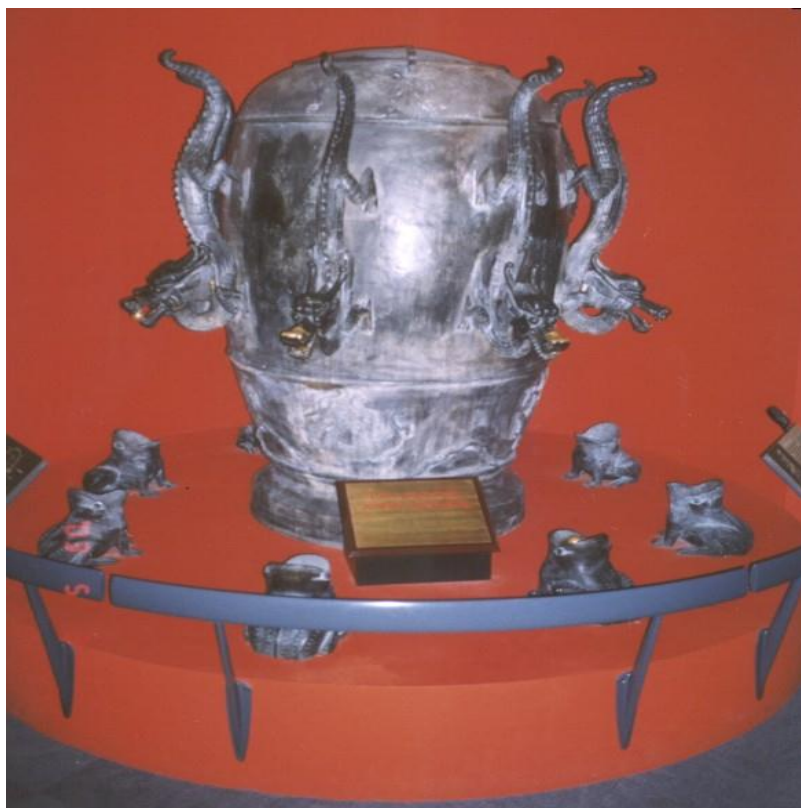
Fig. #H6 (K6 in [1/5]): The above photograph shows an impending earthquakes detector - i.e. a device able to rise alarms before earthquakes strike. Notice that a more comprehensive description of this wonder device is provided on separate web pages seismograph.htm and telepathy.htm .)

dragging this corner upwards-left to receive the size of this different window that you wish to have (notice that since you downsize a first such a Figure, all next clicked on will appear already downsized - unless you enlarge them in the same way), and then (3) drag this another window with the picture you wish to relocate to the area of this web page where you wish to look at it (to move it you just grab it with your mouse by the blue stripe on the top of it). Notice also that if you scroll (with scroll bars) the text of the page when you read it, this another window (with the drawing) will disappear. In order to return it into the new position, you need to click on its "icon" (name bar) on the lowest part of the screen.