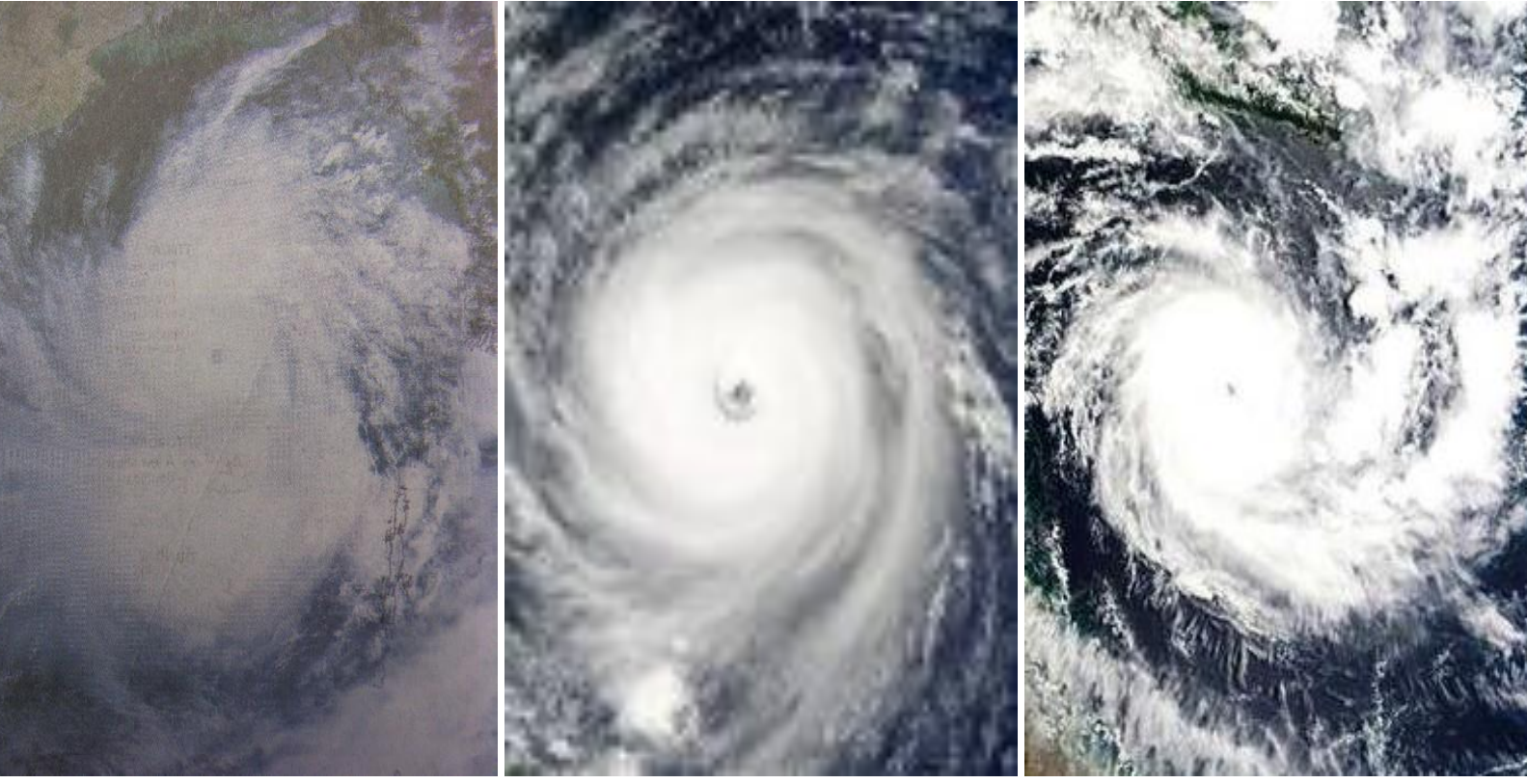
Fig. #E1abc: Photographs which illustrate these features of the cyclone "Nargis" that disclose its technical formation by UFO vehicles. Namely, in

10. Black (burned) bodies of dead victims of the cyclone. According to reports provided amongst others in the above article [1E2], and also in another article "A journey from horror to sorrow" from pages A1 and A3 of the newspaper The New Zealand Herald, issue dated on Friday, May 9, 2008, the sight of dead victims of the cyclone "Nargis" revealed "... blackened bodies of people and animals ...". In turn similar blackened, like burned to charcoal, bodies of animals I personally saw during my research on the UFO landing sites in New Zealand. For example, in the lowest UFO landing site shown in "Fig. #E1" from the web page"ufo_proof.htm" - about the formal scientific proof that "UFO vehicles do exist", I found a hedgehog that was magnetically burned and dried out by a powerful magnetic field of a UFO. This hedgehog was black like these burned bodies of victims of the cyclone from Burma. It was so dry that when I touch this hedgehog it disintegrated into a powder. Of course, in Burma these black bodies most probably do NOT disintegrate into a powder. After all, opposite to this hedgehog, the Burma bodies were larger - thus probably less burned by the magnetic field of UFOs. Also above Burma UFO vehicles were moving, not hovering motionlessly like above landing sites in New Zealand. Furthermore, in Burma bodies were NOT dry, but well wet in water brought by the cyclone.