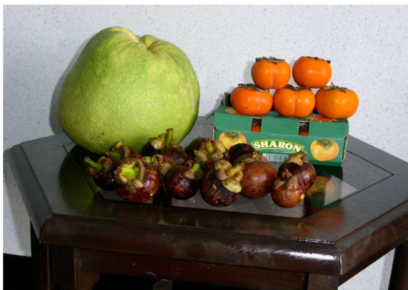
Fig. #11: A mixture of tropical fruits. It includes (counting from the left): (1) greenish "pomelo" which is as huge as a human head ("pomelo" is shown also in "Fig. #E2"), (2) apple-sized, round "mangosteen" (these below pomelo, i.e. ones which look like gigantic European blueberries of the size of average apples), and (3) fruit named "persimon" (these above, on the right, which look like pumpkins of the size of typical apples). One of the most tasty varieties of "persimon" fruits, imported from Israel, is usually called the "shanon fruit".

From the energy content point of view, "persimon" belongs to the category of "heating" fruits. Chinese recommend that one should display a moderation in eating it. It is also recommended, that after eating it one should neutralise their heating energy by an immediate eating an equal amount of something that contains the "cooling" energy.