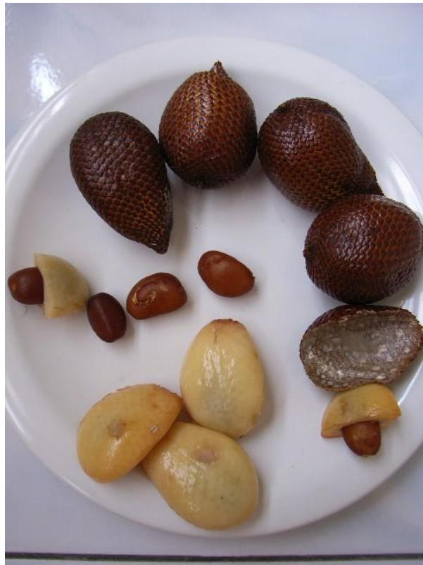
Fig. #D4: Extraordinary fruits from the area of Pacific called "salak". The supernatural attribute of this fruit is that it looks as if it was created especially to remind illustratively to people the Biblical story about Eve and the snake - for details see descriptions from item #D4 above. (Click on the above photograph to see it enlarged.)

The above photograph shows four complete "salak" fruit placed in the upper part of the saucer. It is worth to notice that they look like snake heads. Under them segments of this fruit are shown peeled from the "snake skin" (a section of this "snake skin" is also shown). The photo illustrates also the appearance of inedible stones from this fruit, as well as sections of the fruit in which still remain such stones.