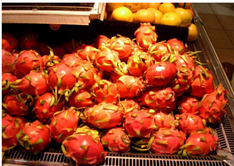
Fig. #E6a: Favourite fruit of Vietnamese, called "dragon fruit".

From the energy content point of view, "dragon fruit" belongs to the "neutral" fruits. Chinese claim that one may eat any amounts of it without causing undesirable consequences.