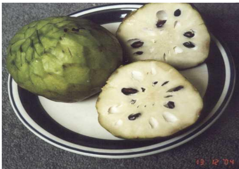
Fig. #F2a: An interesting fruit called "custard apple". Shown here is a "domesticated" variety, which in the area of Pacific currently is planted mainly in tropical part of Australia. This "domesticated" variety of the "custard apple" has more edible substance and less seeds than "wild" varieties grown in Malaysia. However, the taste of all of these varieties are almost the same.

varieties are similar in size. But the surface of the "wild" Malaysian variety looks like the surface of an European wild "blackberry" enlarged to the size of an average apple. It can be eaten ripe in two colours, blue or green. In turn the "domesticated" variety has rather a smooth skin, which has a slight "blackberry" pattern on it. It has only a green colour. The "domesticated" variety has also less seeds inside and more this edible custard-like substance. The taste of this fruit is sweet, with a refreshing sour but very pleasant flavour. This fruit is very tasty and very pleasant in eating.