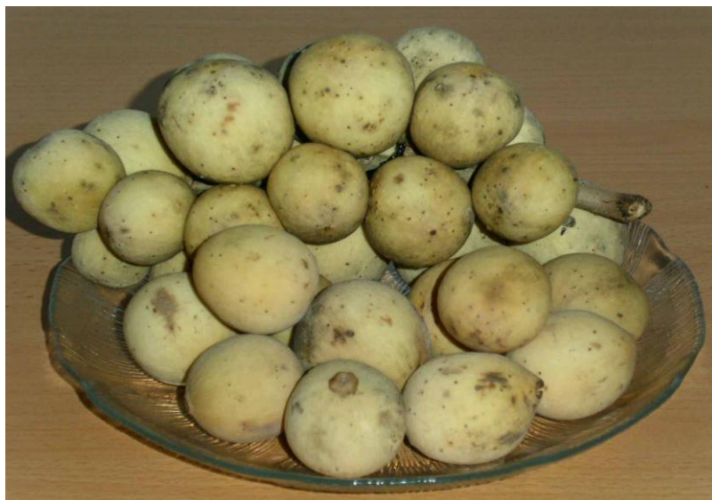
Fig. #G2: Very tasty Malaysian fruit called "langsat".