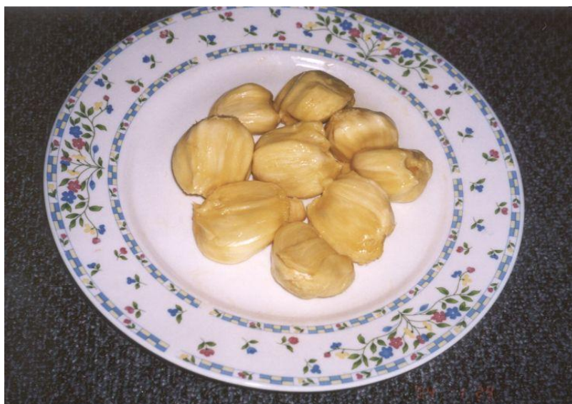
Fig. #H2c: Fruit of tropical "chempedak" after being taken from the shell and served on a saucer in a form ready for eating.