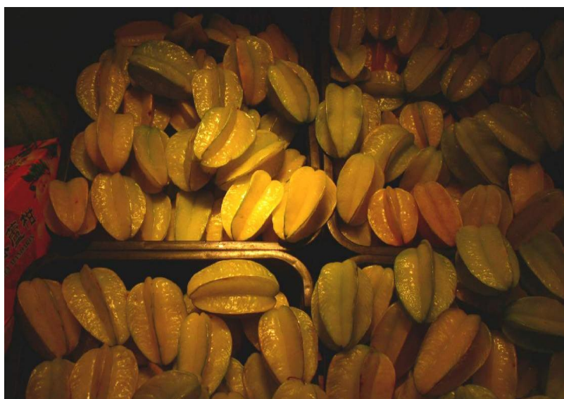
Fig. #F3: "Starfruit". The name "starfruit" for it, originates from the shape that it has. Especially if it is cut into slices in direction perpendicular to the central axis of it. Then such slices look like golden stars of the diameter of our slice from an average apple. The colour of this fruit is also very nice. It is golden, similar to the colour of a typical honey. Because of the beautiful, star-like shape and golden colour of slices of this fruit, in restaurants from tropical countries it is used for decorating other dishes. Of course, apart from decorative value, it is also edible.

From the point of view of their energy content, "starfruit" belong to fruit strongly "cooling". In old times Chinese used to recommend a moderation in eating them. They also used to recommend that eating of this fruit is balanced by eating an equal amount of something "heating" - especially if the eater is a woman. However, in present times of the excessive eating of "heating" junk food, this old recommendation does not need to be obeyed so pedantically - as I explained this in the introduction to this web page.