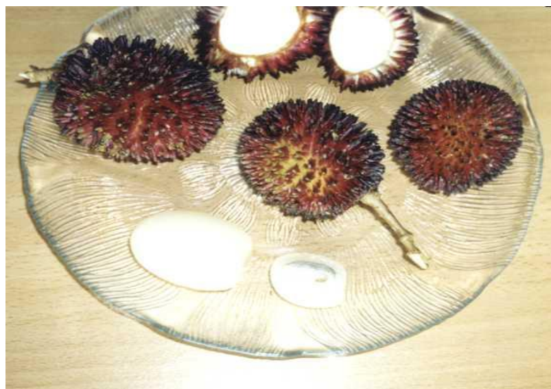
Fig. #H4: Tropical Malaysian fruits called "pulasan". They belong to the same family as "rambutan" do. In fact, for an European the appearance and taste of pulasan usually is indistinguishable from the fruits called

From the energy content point of view, "rambutan" and "pulasan" belong to "wet-heating" fruits. Chinese recommend that one should display a moderation in eating any of them. It is also recommended, that after eating any of them one should neutralise the undesirable consequences by eating immediately an equal amount of something that contains the "cooling" energy.