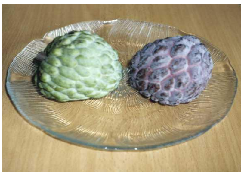
Fig. #F2b: Here is the "wild" Malaysian variety of "custard apples", similar to the ones shown below on "Fig. #F2a". As one can see from the above photograph, in Malaysia two varieties of this fruit are available. They differ