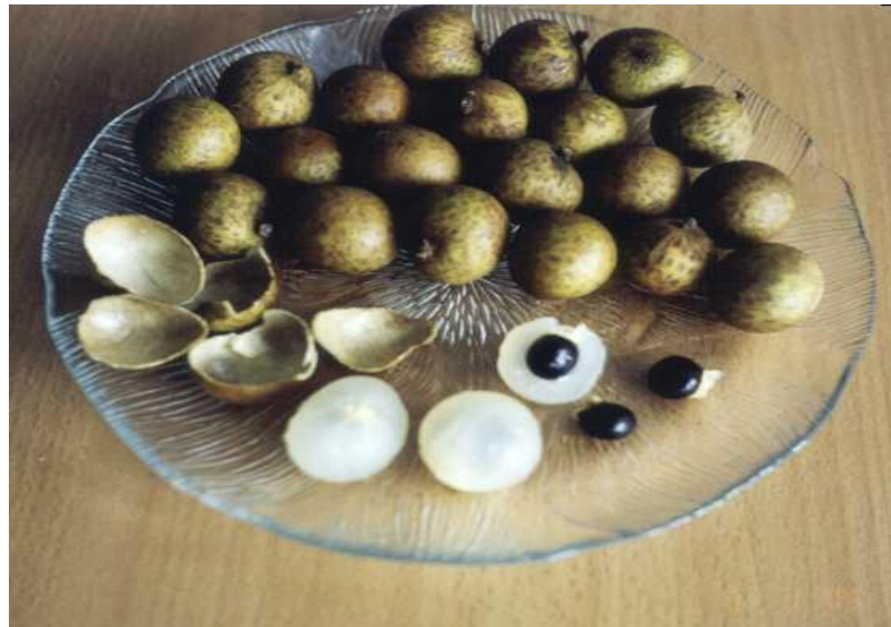
Fig. #G4: Very tasty Malaysian fruits called "dragon eye" or "longan berry". I.e. the "dragon eye" is a name given to it by Chinese (it should NOT be confused with the name "dragon fruit" given to the vegetable-like fruits shown in photograph from "Fig. #E6" of this web page). Longan berry (dragon eye) is smaller from langsat by a half of size. The skin of it is thin and hard - but easy to crack. It also has inside a large seed. The seed is black, with smooth, glossy surface. It has the size of an European cherry fruit seed.

The above photograph shows the appearance of the fruits "dragon eye", as well as the appearance of all ingredients of this fruit. And so, on the top of this photo whole fruits are visible. They have the light-brown colour with like brown stripes running through them. Their size is similar to size of European sour cherry. In the lower, left part of the photograph, skins taken from these fruits are shown. In the centre "dragon eye" already peeled from the skin are illustrated - the top one of them is cut horizontally to show the seed of it. On the right, two black seeds from this fruit are shown. The seeds of "dragon eye" are inedible.