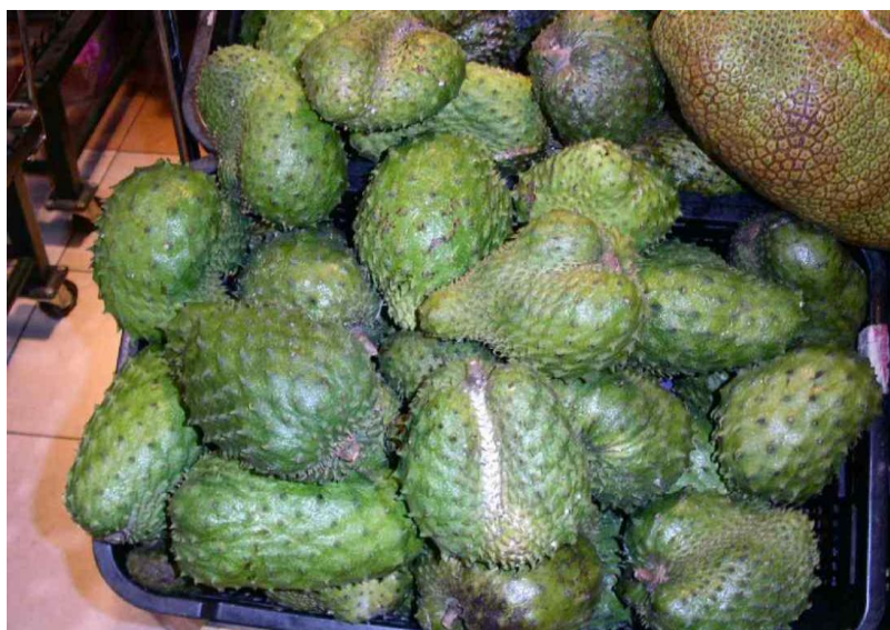
Fig. #E3: A stall with tropical fruits named "soursop". This fruit is a favourite of my brother. The brother almost worships the taste of it when eaten raw. The fruit has a powerful sour-sweet taste. I am not crazy about it, although I can also eat it. But I love juice from "soursop" fruits sweetened with honey from wild tropical bees - especially if this juice is mixed with the juice from "guava" fruits.

From the energy content point of view, "soursop" belongs to the category of "neutral" fruits. Chinese claim that one may eat any amounts of it without causing undesirable consequences.