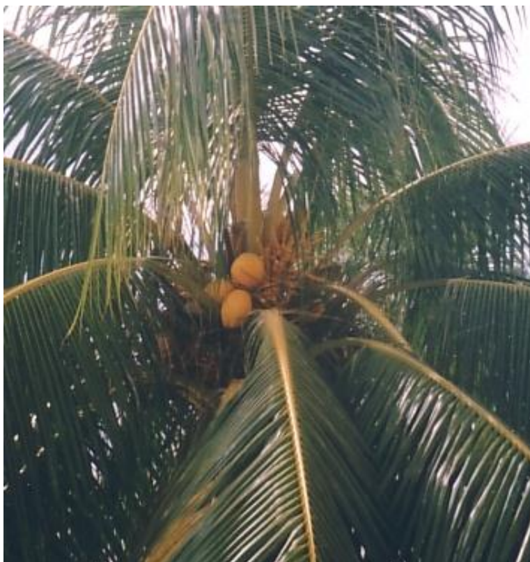
Fig. #D1a: A Malaysian coconut palm with clearly visible coconuts.

Summarizing the above, truly there is no other plant on Earth, which for people would have equally many useful applications, as the coconut palm has. No wonder that this palm is considered to be a holy tree similarly like in the Europe of old times people acknowledged the holiness of the daily bread .