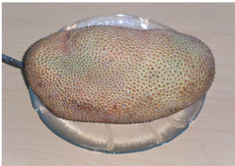
Fig. #H2a: Tropical fruit called "chempedak". Similarly as in case of durian

From the energy content point of view, "chempedak" belong to the "wet-heating" fruits. Chinese recommend that one should display a moderation in eating it. It is also recommended, that after eating it one should neutralise the undesirable consequences by eating an equal amount of something that contains the "cooling" energy.