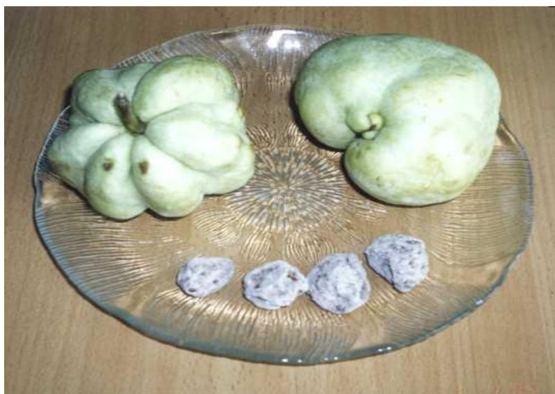
Fig. #E5: An interesting fruit called "guava". Shown are two fruits lying in the back part of the saucer. Just by itself this fruit is NOT pleasant for eating. But it takes an interesting taste if one sprinkles it with the grated aromatic Chinese preserved plum. In the lower part of the saucer three such preserved plums from China are visible. After these plums are grated (on a grater) usually they are sprinkled over pieces of guava that before were peeled from the skin and cut into small segments. The plums (used

From the energy content point of view, "guava" belongs to the category of "neutral" fruits. Chinese claim that one may eat any amounts of it without causing undesirable consequences.