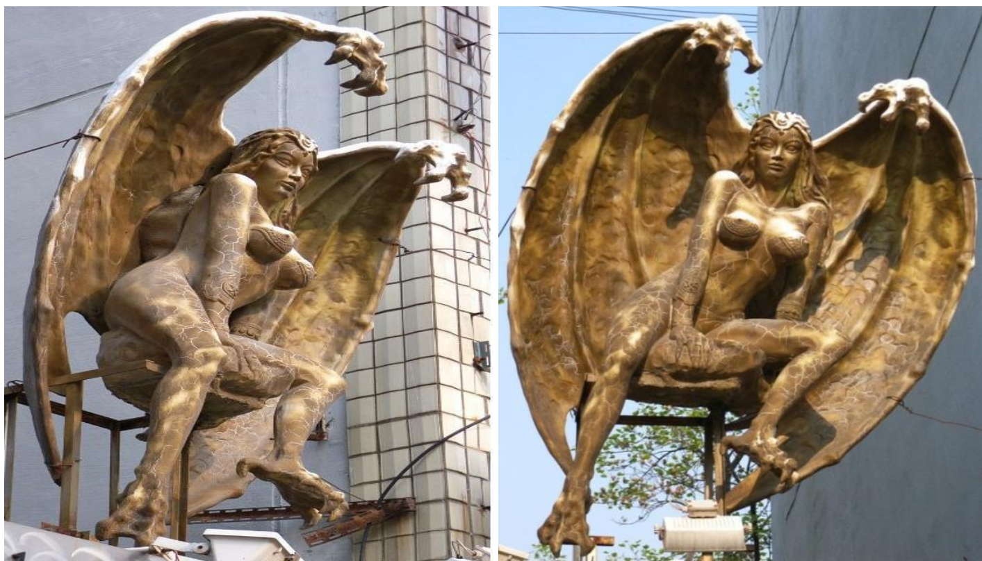
Fig. #K2: Genetically engineered mutant which supposedly is a result of short-sighted genetic experiments of UFO-nauts. It represents genetically mutated monster which is a cross between a human with genes of selected animals. For example his hands and fots are replaced with paws of a lizard of pray - perhaps from a version of crocodile or comodo dragons. Practically in all cultures of the world this creature is known as a "devil with cock's claws" - as an example I suggest to recall the poem "Pani Twardowska" of the Polish poet named Adam Mickiewicz "... chicken legs and cock's claws he had. ..." On the above sculpture reflected is a "female version" of this "devil". In order to allow a better

while from the belt downward had the appearance of goats. To their examples belong, amongst others, "hoofed devils" widely known in the medieval times, and also "satyrs" from the ancient Greek. The ancient Greek knows also the goat-footed god "Pan". In turn horned monsters include, amongst others, medieval horned devils. Furthermore, horned was also the German god Wotan, and the god of Vikings named Odin which travelled on the "flying horse" called Sleipnir (a UFO vehicle?). Horns had also Moses (the one which took Israelis from Egypt) - which the fact is immortalized even on the sculpture of Michael Angelo "Moses" (to be seen in the church San Pietro in Vincoli in Rome). Furthermore, on one English documentary film about Alexander the Great it was claimed that this Macedonian monarch also had small horns - the fact of which is supposedly recorded even in Koran. (Such information induces in us a question, who actually was Moses and Alexander the Great - i.e. were they horned versions of present UFO-nauts-changelings .) Every place on the Earth knows further mutated monsters of a partial characteristics of a human. However, all of them were just clumsy monsters. UFO-nauts are simulated as being too stupid to successfully play God!