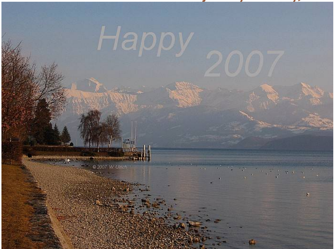
February afternoon at Lake Thun, Switzerland Click for panorama

„If theorizing is all that matters, it may not matter all that much in the end.”