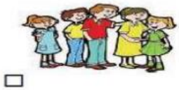
visit relatives Visitar parientes

5. Write ✓ for the activities you did on vacation and write ✗ for the ones you didn't. Escribe ✓ para las actividades que hiciste en vacaciones y escribe ✗ para las que no hiciste.