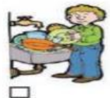
wash the dishes Lavar los trastes