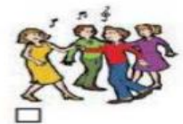
have a party Tener una fiesta