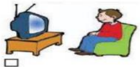
watch T.V. Ver televisión