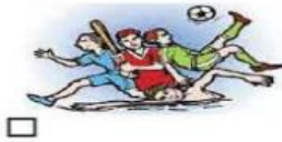
practice a sport Practicar un deporte