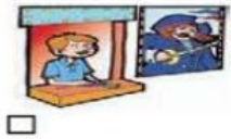
go to the movies ir al cine