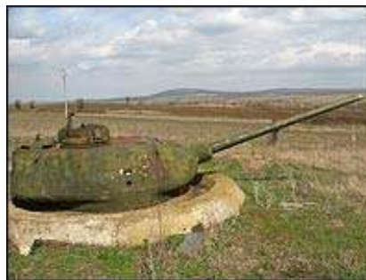
A Russian T34/85 tank turret.

The tanks and their adjacent bunkers were forgotten by the army, but not by souvenir hunters. Bit by bit they were scrapped and it became a lucrative business in Bulgaria.