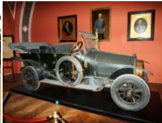
The car of Franz-Ferdinand