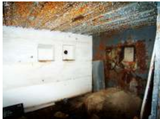
The machine-gun room with the plate.