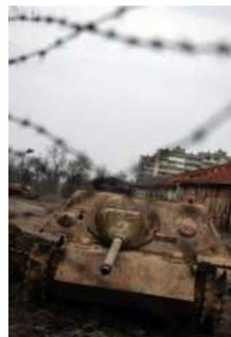
A German Jagdpanzer IV L/48 tank

In March 2008 12 tanks have been excavated so far. A defence ministry agency is storing them until the army