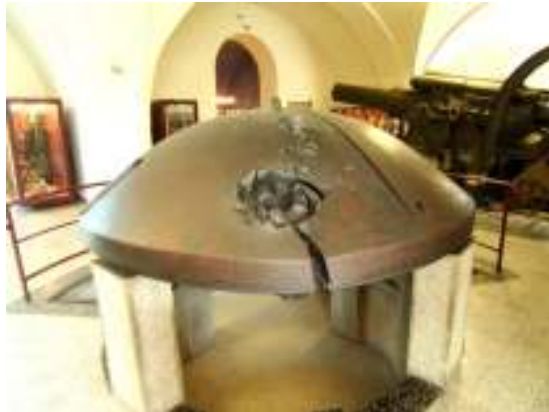
The Kessel turret