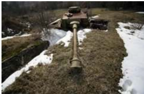
A German Panzer IV tank half-buried at the Bulgarian-Turkish border

After the dissolution of the Warsaw Pact in 1991, Bulgaria joined the NATO in 2004.