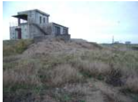
Command bunker 610 during January 2008.

On the sea-side they will create again a salting area and on the land-side a fresh water dune area. They will excavate the sand from the bunkers and remove the additional constructions that spoil the original design of the bunkers. The command bunker (610) will be the central point of the guided tour and the crew bunker (656) can be visited with a guide. Moreover the open emplacement in front of the 610 and the embrasure of the machinegun casemate (515) will be excavated of sand. But the accent will be on nature. All these works will be executed with the aid of the Flemish government, Natuurpunt and C-Power.