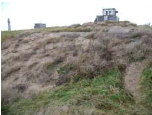
The crew bunker for 15 men, Regelbau 656, in January 2007.

During the autumn, one of our members warned us that the all the bunkers of Stp Dietl at the "Halve Maan" (half moon) near the port estuary have been covered with sand. Only the open emplacements survived. A sad destiny for a monument protected since October 1997 ! What's the present situation ? A company is busy with the destruction of the eastern pier and between the slipway and the Halve Maan they are building windmills. The owner, Maritieme toegang (Maritime Access), says they have the bunkers closed for security reasons. People could fall off it and strange things happened inside. They declared that a renovation project will follow after the finishing of the windmills. Let's hope !