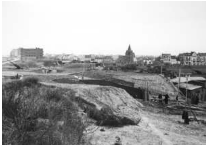
This is an overview of the whole battery looking in the direction of the church of Mariakerke.

Last summer, one of our members, Mr Pierre Nowak, discovered the remains of an open emplacement of one the heavy FlaK batteries around Ostend. The open emplacement lies very close to the church of Mariakerke. You see it when you start walking towards Raversijde on the small road on the land side of the dunes. You see the back of an emplacement because the front part lies under the sand. This discovery leads us assume that the constructions in the dunes are still there, but covered with sand.