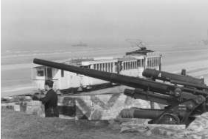
This is probably the best know photo of Stp Boelcke with one of its 88 mm guns

What do we know about the FlaK at Ostend?