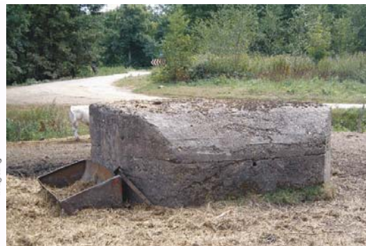
Observation bunker, nr 93.

Some bunkers lie just next to the area that was bought, but good agreements were already made with owners.