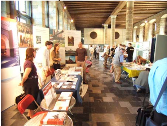
A general view on the fair.