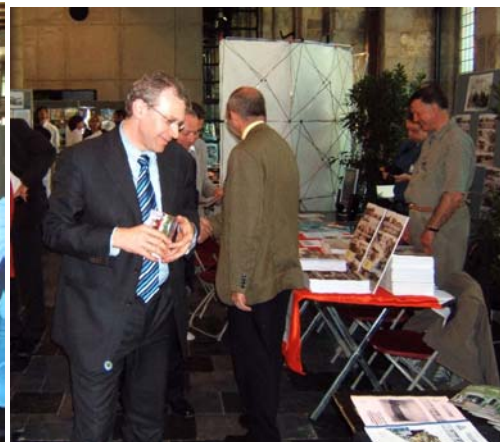
Minister-President Yves Leterme.

A total of 19 associations and publishers were present at our Fortendag comprising 1 Polish and Belgian publisher, 13 Belgian associations, 5 French associations and 1 Dutch author. 9 associations sent us leaflets and posters : 6 French, 2 Dutch and 1 Belgian association.