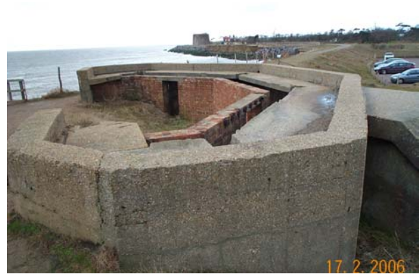
Site of one of the two searchlights

This is not the original but on close inspection this would appear to have been the message on the wall because you can feel the outline of the letters.