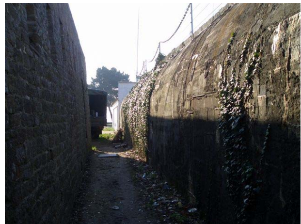
Outside view of the personal SK bunker in which we recovered the material.