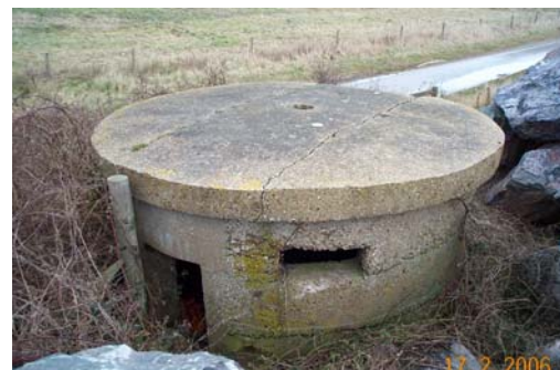
Close up of pill box