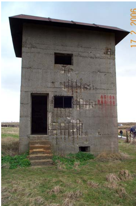
The Battery Observation Post

Bawdsey is more famously known for the radar station at Bawdsey Manor where a great deal of pioneering work was done on radio location. We were not able to visit that site though as our visit was out of season.