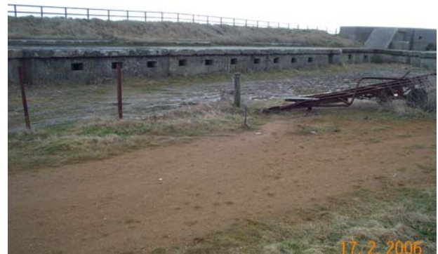
The gun loops.