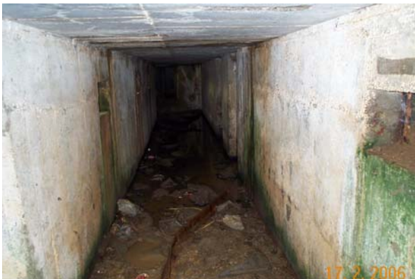
Inside the connecting tunnel.

This is not the original but on close inspection this would appear to have been the message on the wall because you can feel the outline of the letters.