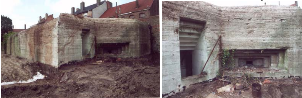
The entrance and the flanking loop hole.

In the autumn of 2000 I wrote an article about this bunker in the initial version of WMF-News (at that time it was a part of the Vesting periodical). It was said that the bunker was due to be demolished as soon as possible. It looked like it was a matter of a couple of weeks. Now, we are March 2006 and I heard from a colleague that the bunker is still there!!! Amazing, isn't it?