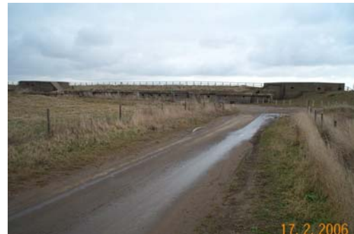
General View of the emplacement