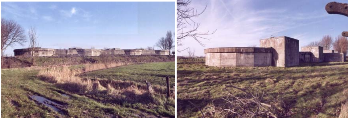
View on one of the oil tanks.

These are Belgian oil tanks. Two of them were constructed before the war and the third was been built after it. A pipe-line led to the barracks along the road leading from Brugge to Zeebrugge. The Germans did not make any use of it during the war. The tanks were in use until the late eighties .