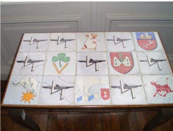
At the same time we were able to visit the manor of Admiral Dönitz and there we saw this splendid table but we didn't get it from the French...

After some contacts between the French Navy and the Belgian Army we received the go ahead at the beginning of January. We had one month to do the exercise because at the end of the month the bunkers must be empty. The Belgian army provided us with equipment and we drove with 13 men to Lorient where the French army made us very welcome. The next day we started dismantling. Luckily we were with a lot of people because it was a hard job. Raversijde needed some doors, Brussels some stoves, doors of a different type, vans and HES filters and De Brand a stove, doors and lots of small equipment to be reused in their SK1 bunker. After we had put the material together to load with a crane, we drove to the U-Boat bunker in Lorient (Keroman) to pick up some drums of the army ( Heer ) and the navy ( Kriegsmarine ) and some filters with agreement of the French Navy. These items which I discovered last year, were due to be scrapped.