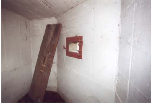
Inside the close defence room.