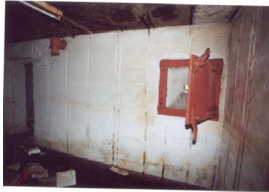
The defence of the entrance.