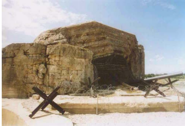
The casemate, type 683, looks again like the picture they have taken in 1944.

Drive to Les Gougins and turn inland here . Then you arrive at the navy battery St Marcouf, Stp 135, the 3 rd battery of HKAA 1261. Due to the fact that the battery came too late at the coast and due to the fact that she was the only navy battery in the region, they assigned her to a army battalion. She was equipped with four 21 cm guns, type Skoda 39/40 L/52. Also you have to add a 15 cm Tbsk C/36 for star shells. The anti-aircraft defense consisted of two 2 cm FlaK Oerlikons and six French 7.5 cm guns. But initially a battery with six 15.5 cm stood here on open emplacements until the actual battery was built. Only two casemates were ready at the moment of the landing, type 683. The fire control post was a special construction (Sonderkonstruktion (SK)) with a FlaK pit on the roof and a steel observation turret (scrapped after the war).