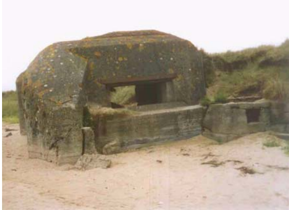
The northern 680 of Stp 9.

next to the southern 680 you see a light construction for a searchlight. It was lucky that the officers of the pilot vessel had made that mistake otherwise it would not have looked good for the 4 th Infantry Division because this had been the planned landing area.