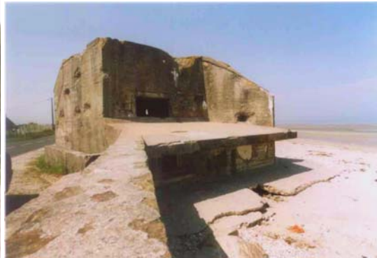
The 667 of WN 12 with the underneath MG room.

The next resistance nest is WN 10 (ex 101) where the monument of French general Leclerc stands. On this spot he came ashore. Next to the typical granite pillar and the M8 armored car and the M5 halftrack, now stands a Sherman M4A2 (Versions A2 and A4 were intended for export). WN 10 is certainly as interesting as the previous one. Left to the monument stands a Vf-casemate for a 4.7 cm PAK 36 (t) and next to this one stands a St-bunker almost buried by the sand, type 676, also for a 4.7 cm PAK 36 (t). Behind them lie three Tobruks next to each other. In the meadow lie two rare Tobruks, type 69. This construction has two holes, one for the mortar and one for a machine gun. On the dune ridge you see an open emplacement for a 5 cm KwK and a huge Tobruk for a tank turret. The northern side is defended by a flanking casemate, type 612. Noteworthy is that this one has a machine gun emplacement on the land side, covered by an armored plate but it has no ceiling.