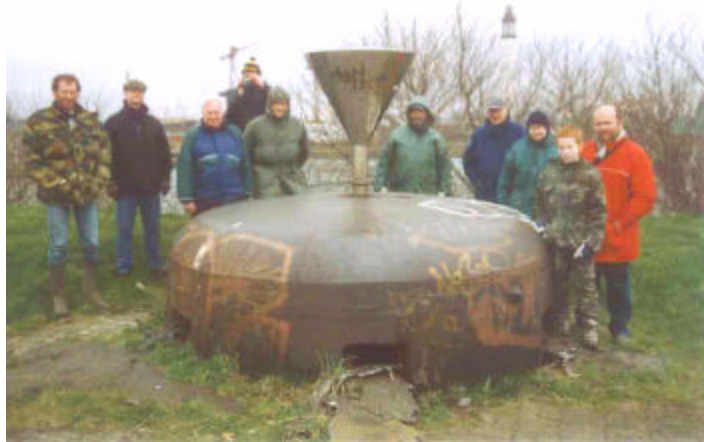
The participants of the Simon Stevinstichting around a Sechsschartenturm in Dunkirk.

To put this forgotten event in the spotlight WMF organised a bunker tour to the pocket on Saturday March the 20 th . 10 brave participants defied the stormy weather and visited in the morning the huge lock bunker of Ecluse Wattier, FlaK -, PAK -, personal- and armoured turret bunkers at the quays. In the afternoon we visited the field batteries that lay during 1944-45 in the flooded area behind the pocket. We saw the remains of a gun, camouflaged bunkers, open emplacements, personal and ammunition bunkers and a dressing station bunker. The tour ended with a visit to the battery Stp Schlieffen at Adinkerke.