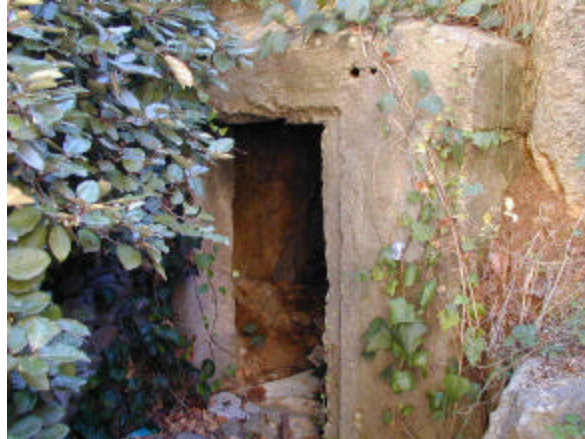
The entrance of the basement

These days the battery lies in the middle of a residential quarter, but the mayor has the site transferred into a botanical garden which protects the bunkers for a while.