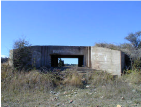
The SK casemate for a 8 cm gun.