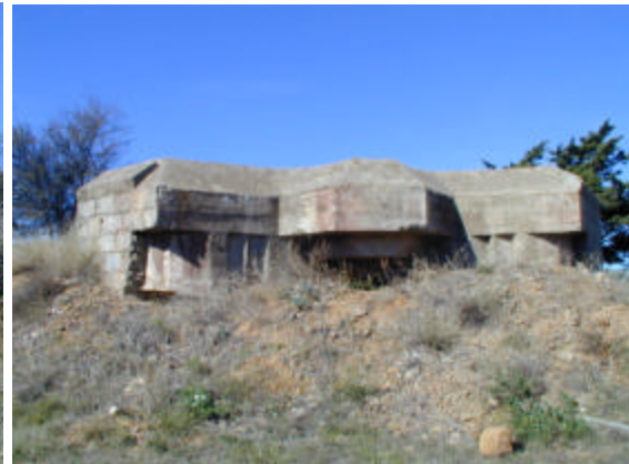
One of the 671's for a 10.5 cm gun