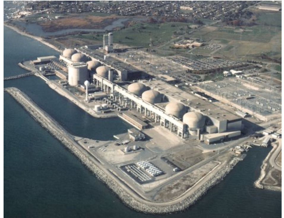
Pickering A and Pickering B facilities on the shore of Lake Ontario

All employees within Ontario Hydro are continuously updating their knowledge about the electrical generating system and the associated power grid. From monthly safety-seminars to focused yearly courses, our employees are one of the best trained in North America.