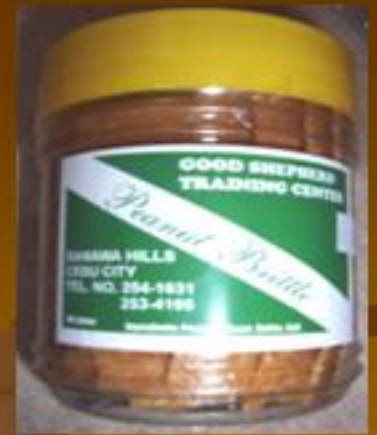
Peanut Brittle 180g $3.00/plstic bot