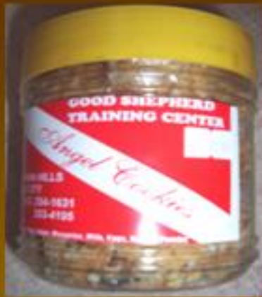
Angel Cookies 350g $3.00/plstic bot