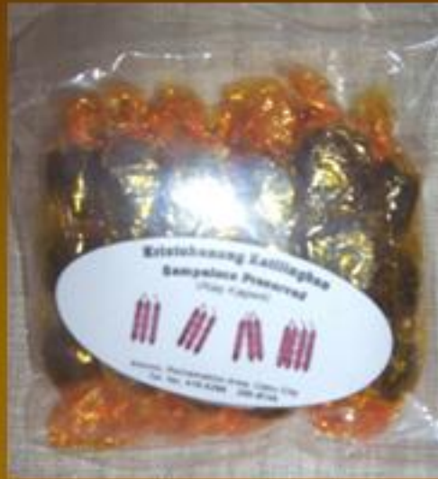
Tamarind Candy $1.50/pck