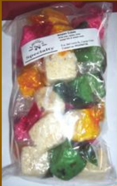
Dried Sweet crunchy rice (Ampao cubee)