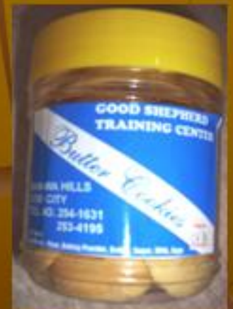
Butter Cookies $3.00/plstic bot