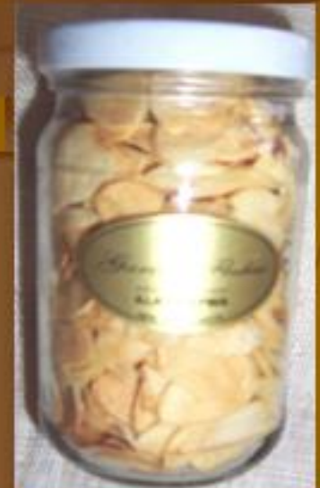
Garlic Flakes $2.88/bot