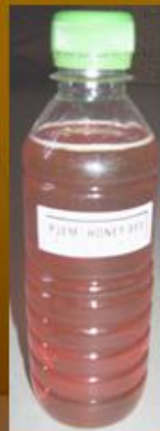
Organic Cultured Honey $4.94/plstic bot