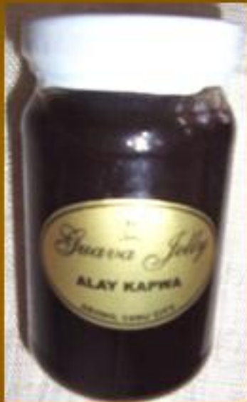
Guava Jelly $2.40/bot