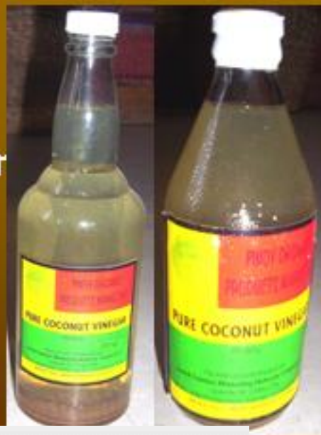
Organic Vinegar $1.04/350ml bot $1.40/750ml bot

Counterpart International is an association of small farmers groups /communities producing coconut, honey, rootcrops, vegetables, and handicrafts. These farmers associations and communities are located In the visayas region.