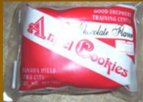
Angel Cookies $1.36/pck