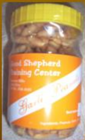
Garlic Peanut $2.20/plstic bot