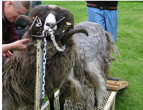
A half sheared sheep

The first step in processing the wool is to collect it. Shearing can be done with use of hand-shears (tools that look like big scissors) or powered shears. Professional sheep shearers can shear a sheep in under a minute, without nicking the sheep once. At many state fairs there are sheep shearing contests, to see who can shear a sheep the fastest. These contests mainly include older men, with only a few youngsters.