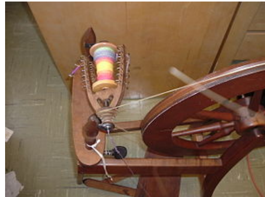
A spinning wheel used to make yarn

Hand spinning can be done many different ways, the two most common being by use of the spinning wheel or the spindle. Spinning turns the carded wool fibers into yarn which can then be directly woven, knitted (flat or circular), crocheted, or by other means turned into fabric or a garment.