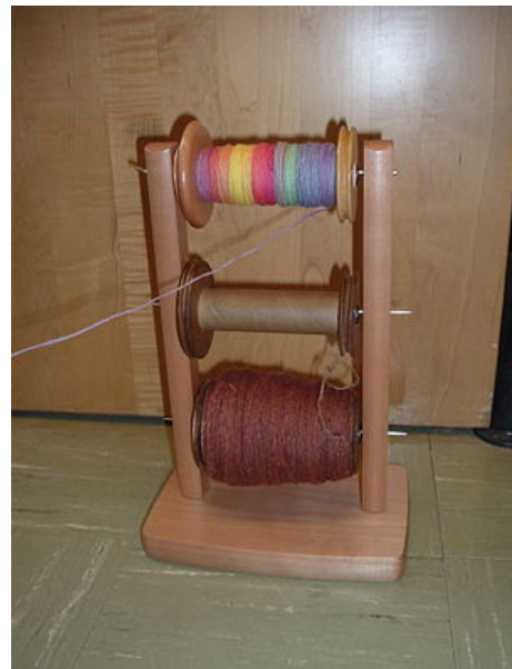
A lazy kate with bobbins on it in preparation for plying.

If the yarn is to be plied then the most common action is to put a new bobbin on the wheel, and leave the yarn on the bobbin so that the spinner can ply directly from the bobbin. This makes for greatest ease when plying, but cannot be done if the spinner does not have enough bobbins. When plying from bobbins a device called a lazy kate is often used to hold the bobbins.