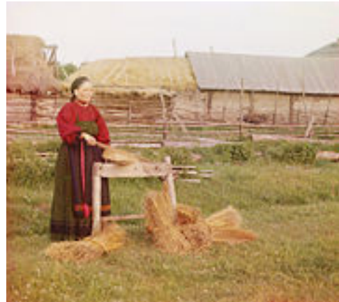
Peasant woman breaking flax

Breaking The process of breaking breaks up the straw into short segments. To do it, take the bundles of flax and untie them. Next, in small handfuls, put it between the beater of the breaking machine ( a set of wooden blades which mesh together when the upper jaw is lowered- it looks like a paper cutter but instead of having a big knife it has a blunt arm), and beat it till the three or four inches (102 mm) that have been beaten appear to be soft. Move the flax a little higher and continue to beat it till all is soft, and the wood is separated from the fiber. When half of the flax is broken, hold the beaten end and beat the rest in the same way as the other end was beaten, till the wood is separated.