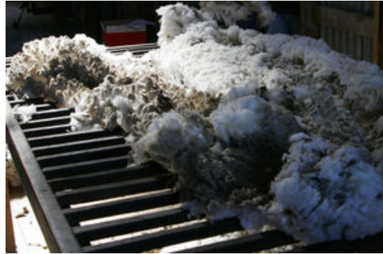
Wool in a shearing shed

Before carding the wool, it must be cleaned. At this point the fleece is full of lanolin and often contains vegetable matter, such as sticks, twigs, burs and straw. One way to prevent the vegetable matter from getting into the fleece is to have the sheep wear a coat all year round.