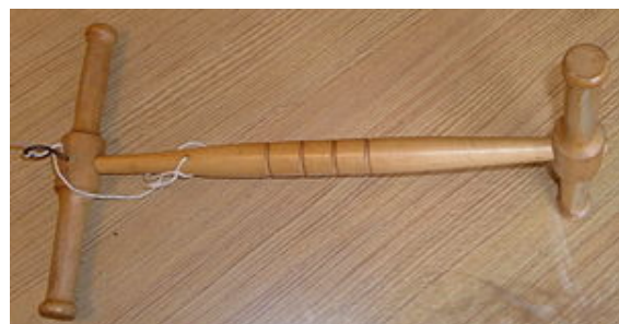
A niddy noddy ready to have a skein wound on it.

Plying yarn is when one takes a strand of spun yarn (one strand is often called a single) and spins it together with other strands in order to make a thicker yarn. There are several ways, the most common being regular and Navajo.