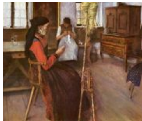
Flax being spun from a distaff

Depending on the preference of the spinner, flax can either be spun from a distaff, or the spinner may simply lay flax fibers in their lap. It is recommended that the spinner keep their fingers wet when spinning, to prevent forming a fuzzy thread, and that the single be spun with an "S" twist. (See Ply above for details). From this point on much of the process is the same as that for wool.