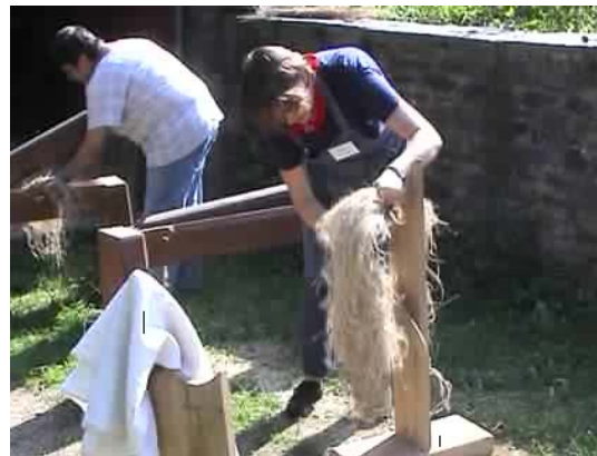
Threshing and dressing flax in the Roscheider Hof, Open Air Museum

Retting is the process of rotting away the inner stalk, leaving the outer fibers intact. A standing pool of water or a plastic trash can is needed. Actually, any type of watertight container of wood, concrete, earthenware or plastic will work. Metal will not work, as an acid is produced when retting, and it would corrode the metal. A tall plastic trashcan with a spigot at the bottom works well. Place as many bundles of flax in the trashcan as will fit, and fill the trash can full of warm water (80 degrees Fahrenheit is best). It is suggested that a lid of some sort be put over the trashcan in order to keep the flax submerged, conserve warmth and contain the stench. After 4 hours a complete change of water is recommended, and 8 hours after that the scum should be washed off the top by the addition of some more water. From then on the scum should be washed off every 12 hours until the retting process is over.