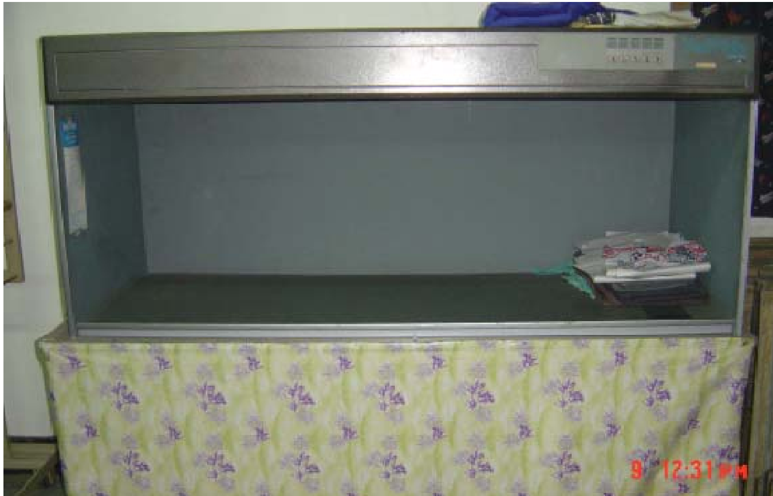
Light Box M/c