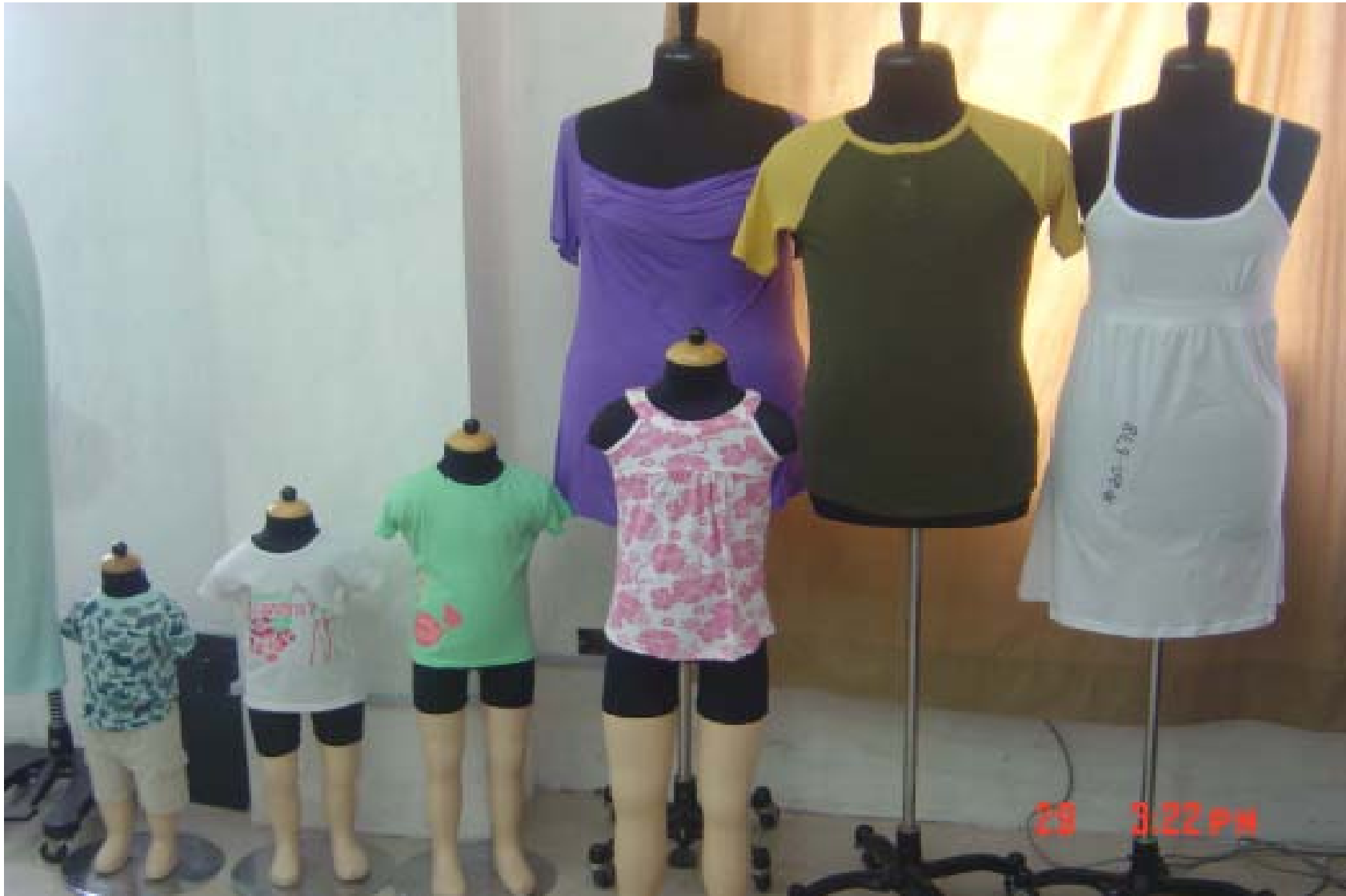
Sample dame fitting section. (QC Dept)