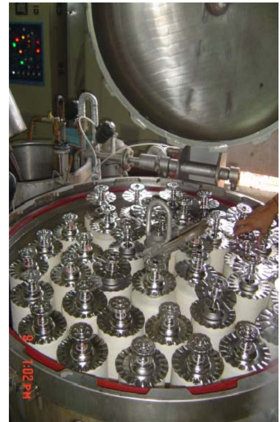
Yearn dyeing machine.