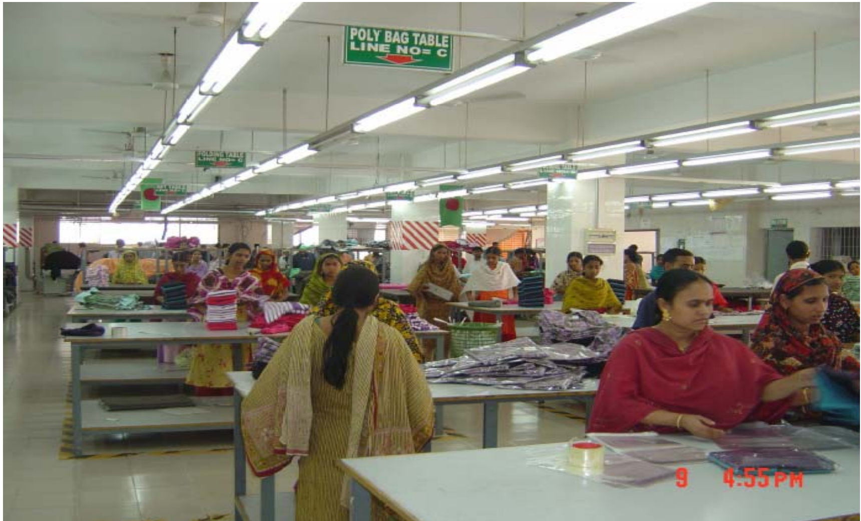
Complete goods packing section.