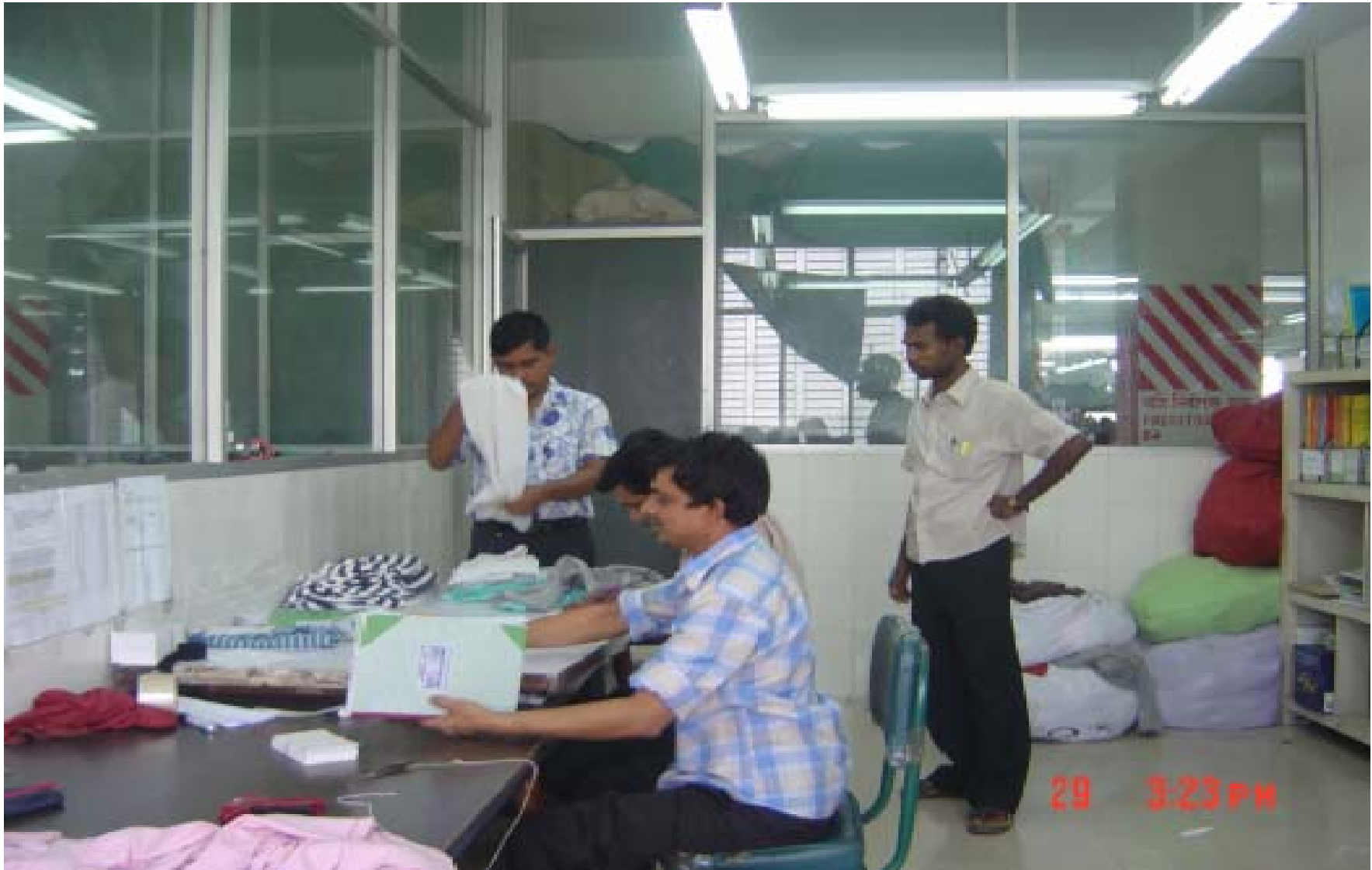
Sample Inspection section. (QC Dept)