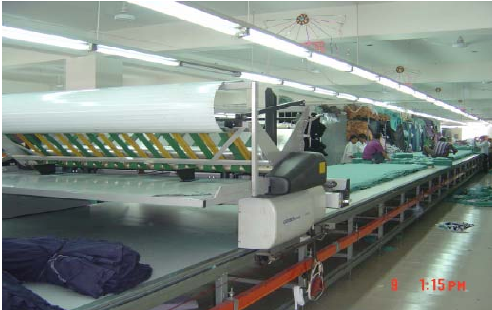
Spread cutter table.