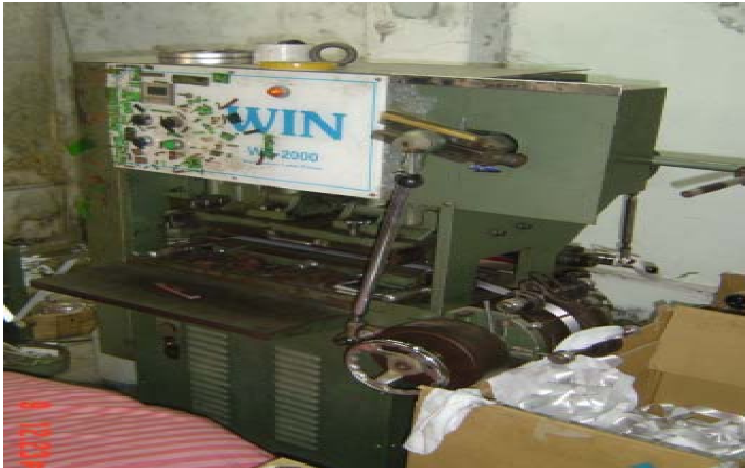
Multi color label printing M/c Par day capacity : 2,36,000 pcs