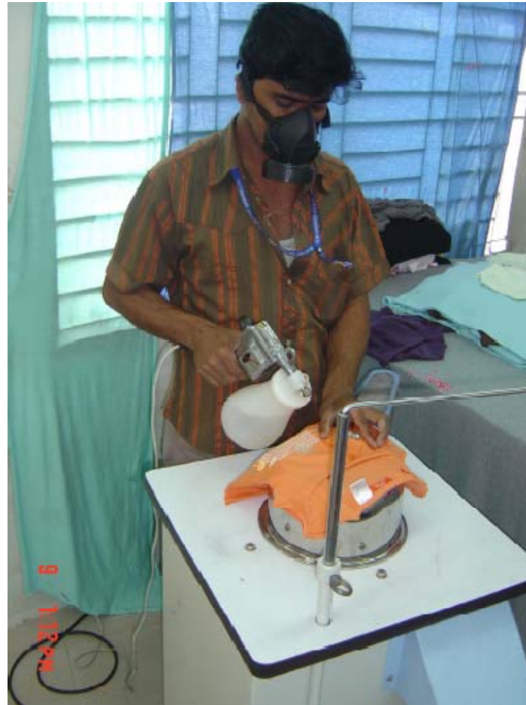
Sport remover section .