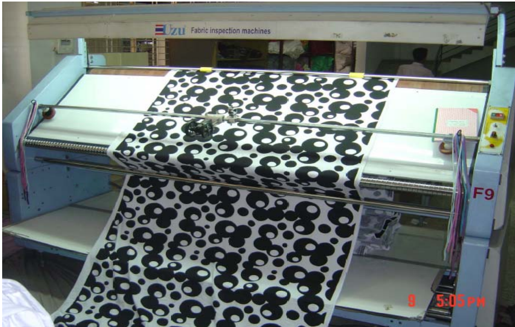
Fabric Inspection machine.