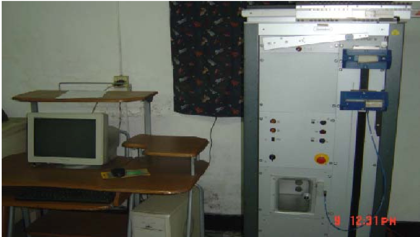
Tensile Testing M/c , Made by # Germany