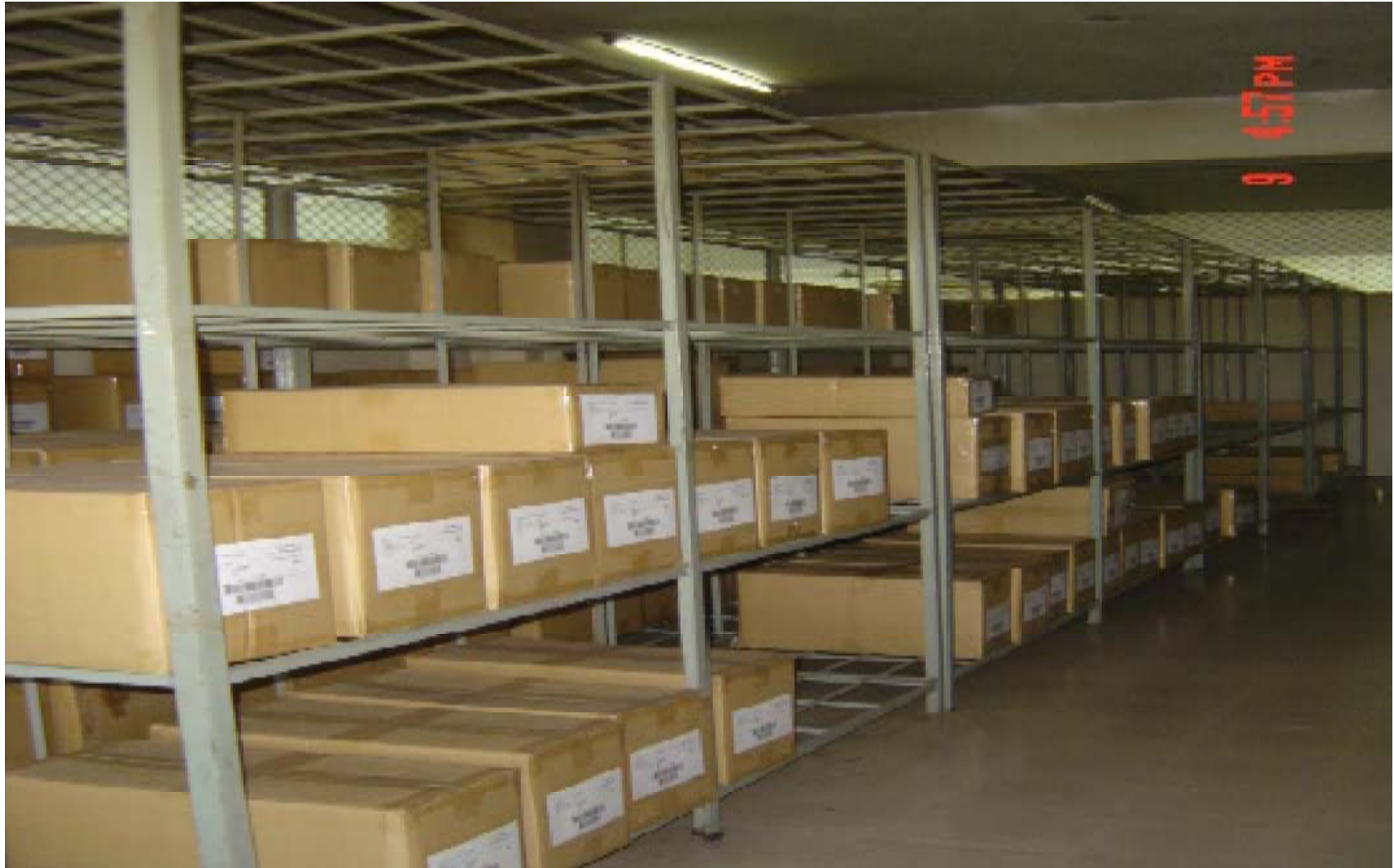
Finished goods trucking section and room temperature is medium no high.