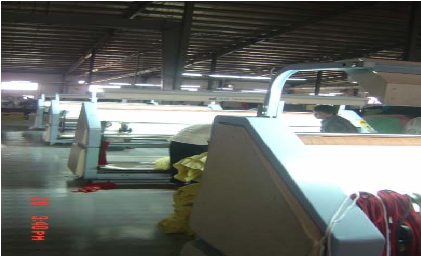
Fabric Inspection machine.