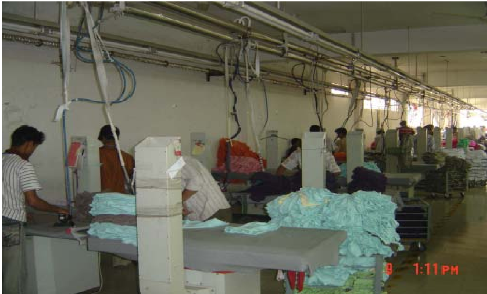
Finishing section – Iron table.