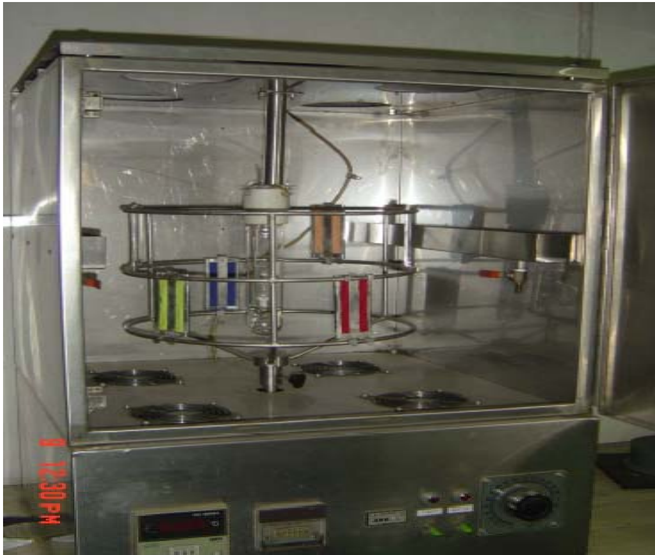
Light Fastness M/c Brand : HANWON