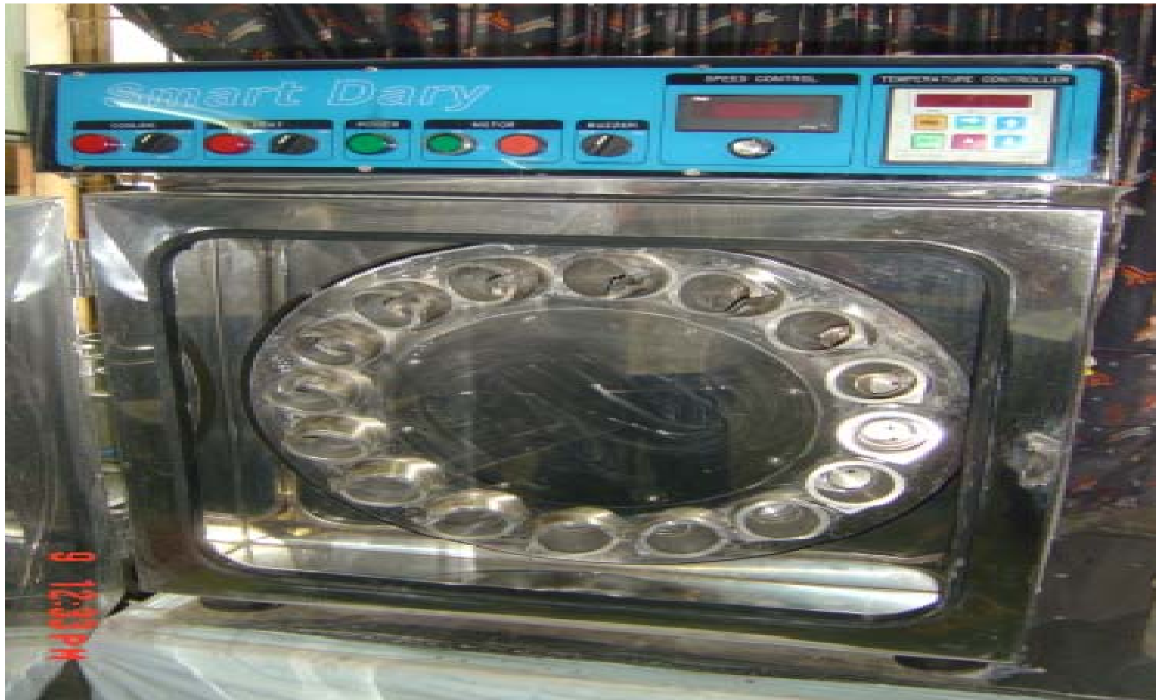
Dyeing M/c (Only for Lab)