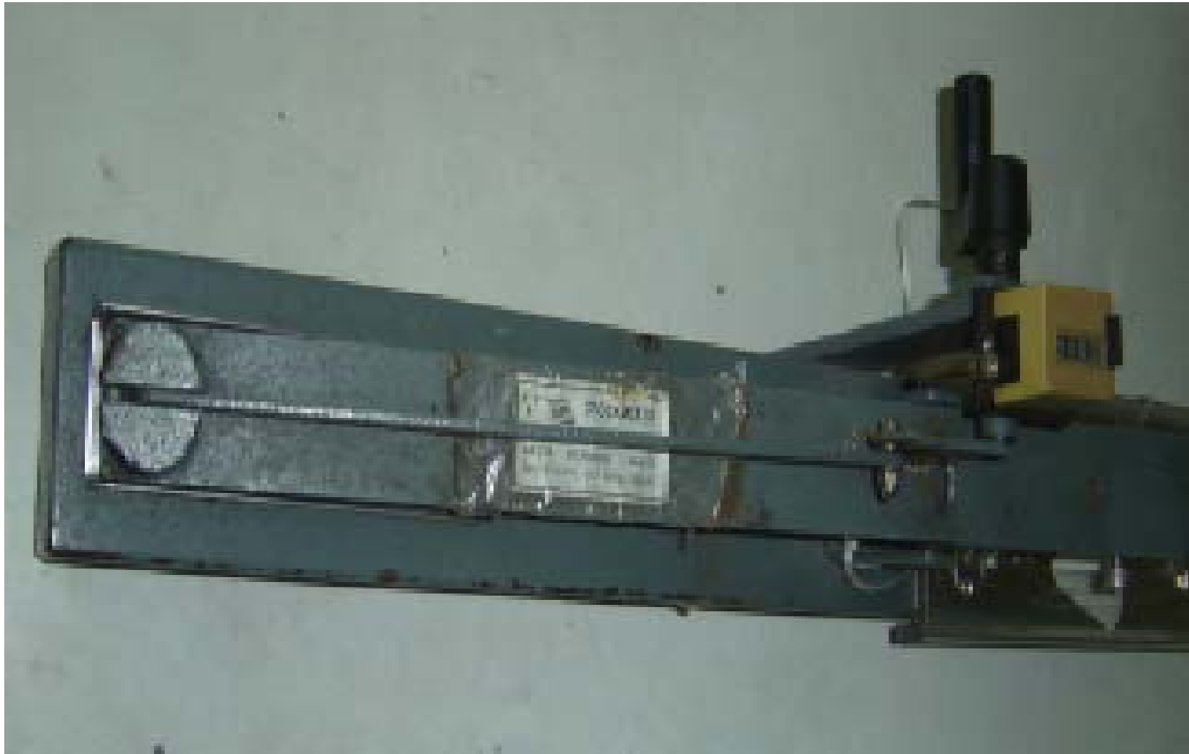
Crock meter M/c , Made by # UK