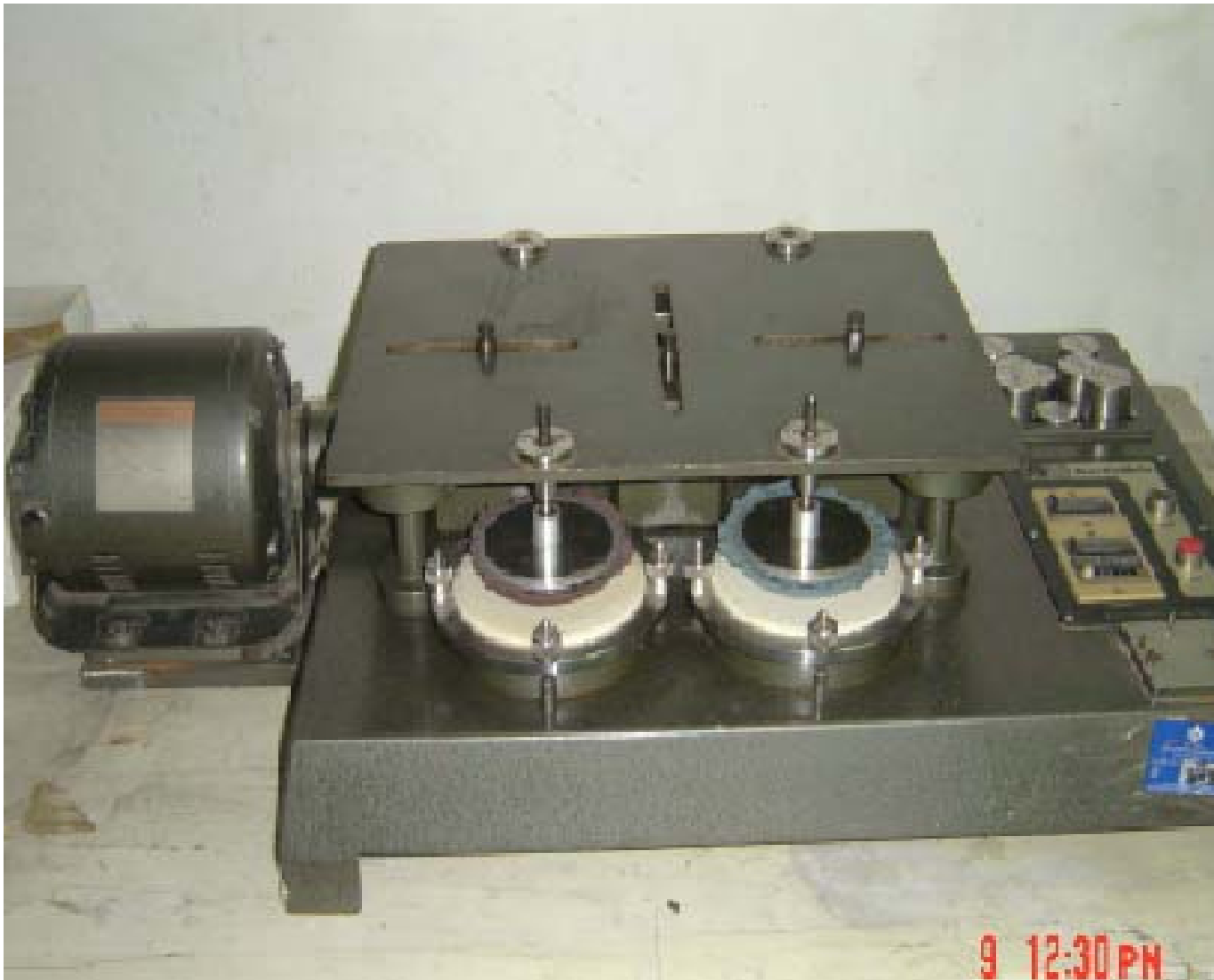
Pilling Tester M/c Made by : UK