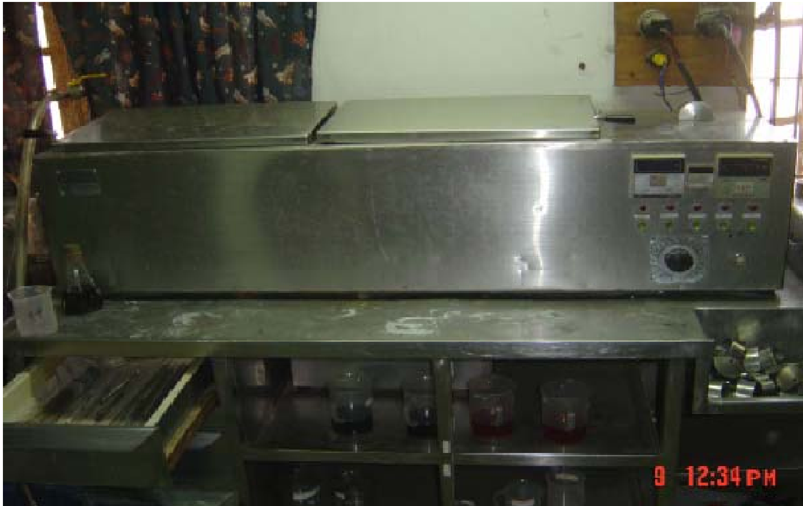
Dyeing M/c , Made by # China