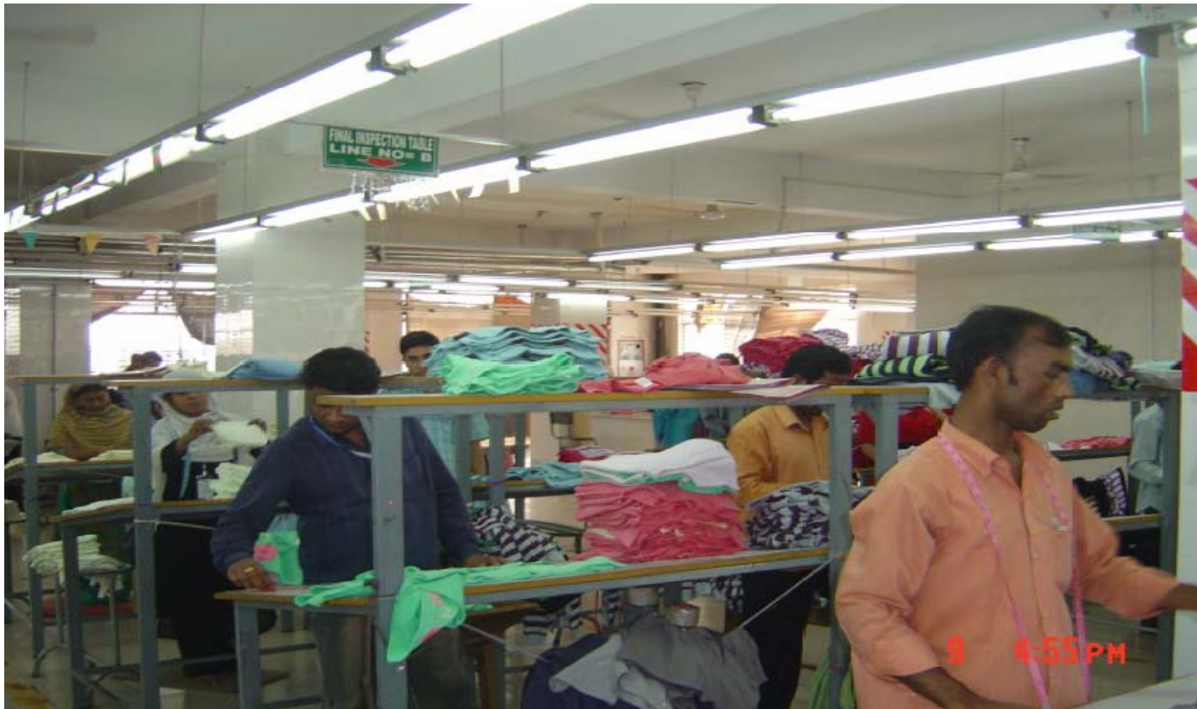
Quality control section.