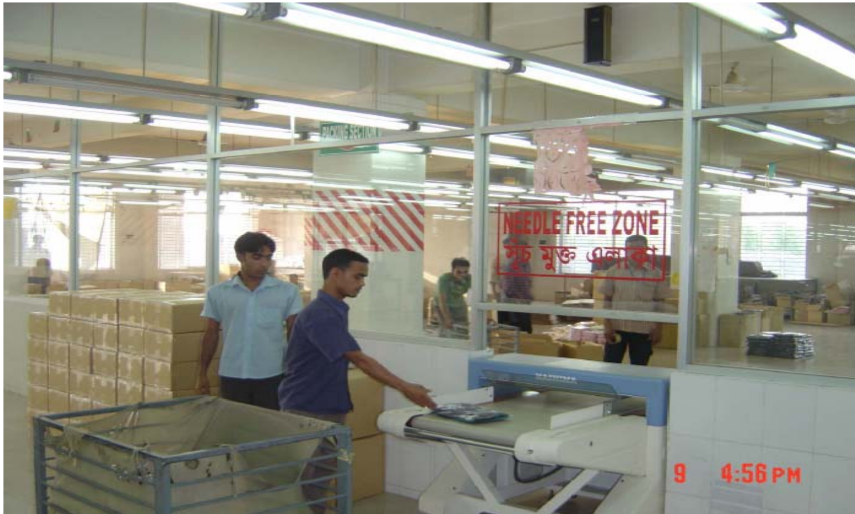
Metal Detector machine.