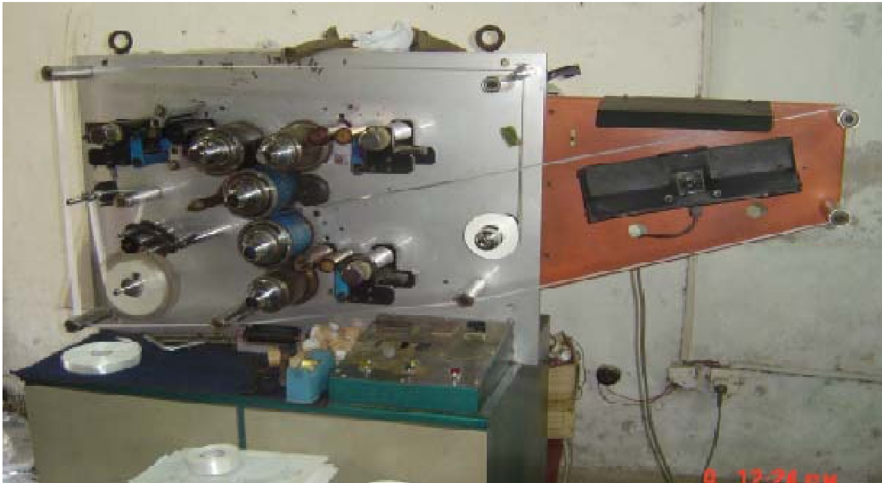
Three color Rotary label printing M/c Par day capacity : 36,000 pcs