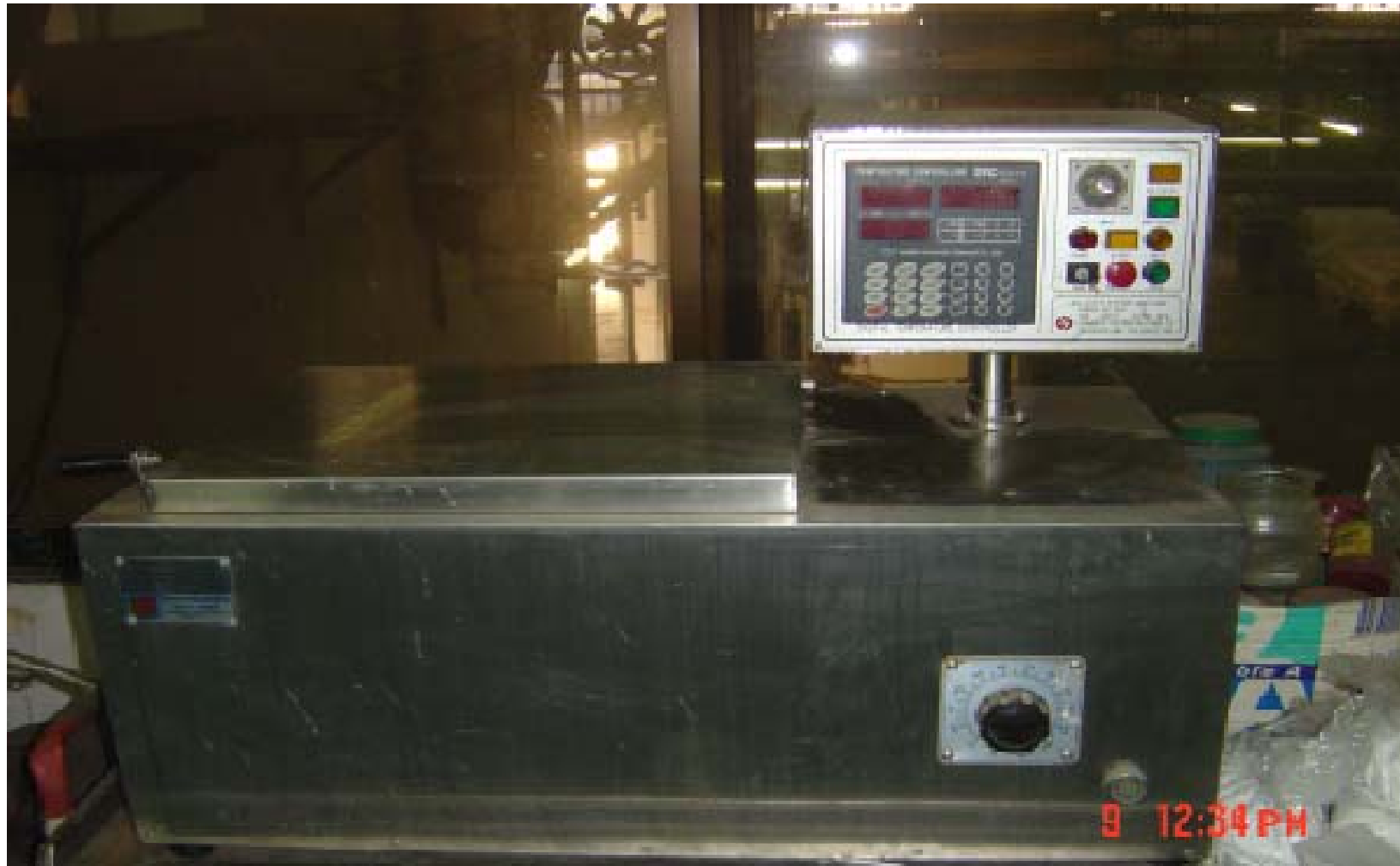
Dyeing M/c (High Temperature), Made by # China