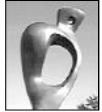
— Esplanade Trash Can

"Drinking. And between beers, I crank out a newsletter."