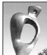
— Esplanade Trash Can

"I love listening to cover bands who evidently have some relative in TAC."