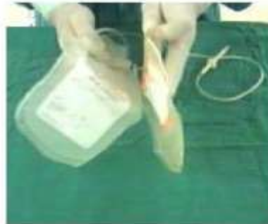
Two Transfer bags