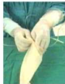
Cover with The Long Glove