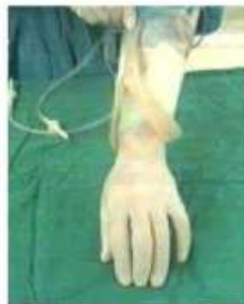
Put on The Forearm