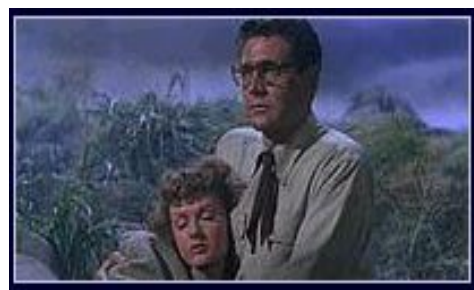
Gene Barry, Ann Robinson

"War of the Worlds", 2005. This version of "War of the Worlds" is based on the original "War of the Worlds" novel by H.G. Wells, not the 1953 movie that had Gene Barry as a scientist who helps save Earth. This version, Starring Tom Cruise, Dakota Fanning, Tim Robbins, and Justin Chatwin, has its focus on a man who's main objective is to save his family during a Martian invasion.