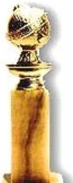
Golden Globe Award

In 1944, a group of journalist from around the world was in Hollywood for the purpose of delivering an impartial view on motion pictures and their impact. They were known then, and to this day as, the “Hollywood Foreign Press Association”. In order not to be swayed and influenced by the powers in Hollywood, not even the Academy Award choices, it was important to them that they give their awards before the Oscars®.