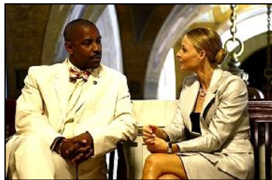
Denzel Washington and Jodie Foster in "Inside Man"

Her latest movie " Inside Man ", directed by Spike Lee, written by Russell Gewirtz, and produced by Academy Award® winner Brian Grazer, is the story of a tough detective (Denzel Washington) who matches wits with a clever bank robber (Clive Owen) in the hostage thriller drama. As the story unfolds, a twist is apparent, a power broker (Jodie Foster) with a hidden agenda adds more instability to a volatile situation. " Inside Man " is well on its way to becoming another hit in the long and impressive resume of Jodie Foster.