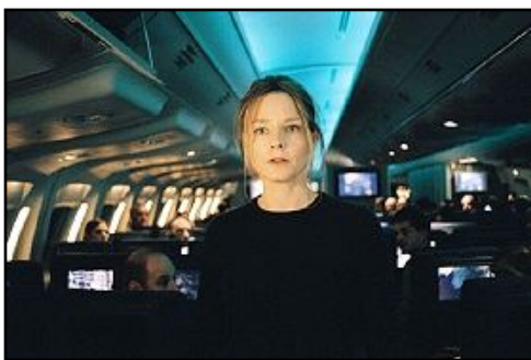
Jodie Foster in "Flightplan"

Gere, and the courtroom sequence that forever "linked" me to two time Academy Award® winner Jodie Foster. There are actors, producers, and directors on my list whose work I see based purely on their name. The "link" (seeing work based on a name attachment) was solidified for me with her portrayal of Ellie Arrowway in director Robert Zemeckis' " Contact " (1997).