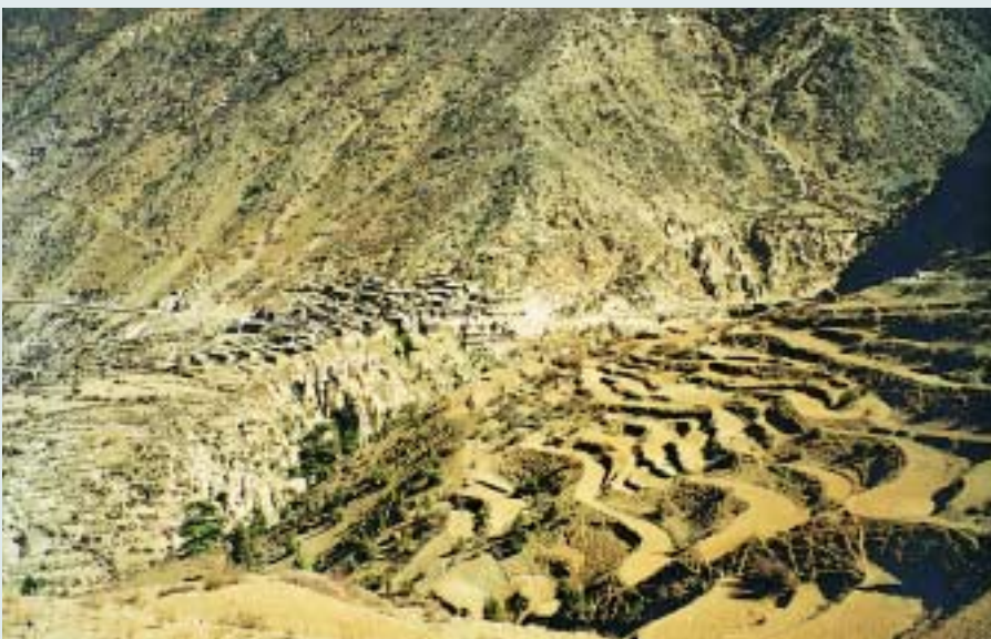
FIGURE 3 As the village of Malari in the buffer zone of the Reserve is in the rain shadow zone, an extensive irrigation system was developed using snowmelt waters from streams.