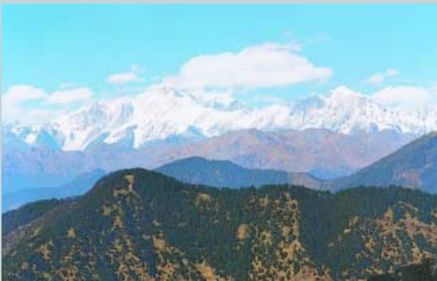
FIGURE 1 Snow-clad mountains with extensive alpine grazing lands constitute the core zone of the Nanda Devi Biosphere Reserve.

economic benefits. The present case study focuses on the issue of crop and livestock depredation by wildlife as a major source of conflict. Feasible solutions in the given socioeconomic context are outlined here; some of these are being tested by the authors in the study area. The results are expected to provide more sustainable livelihood measures and stimulate greater participation in conservation programs.