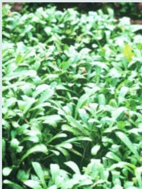
FIGURE 5 Picrorhiza kurrooa , a medicinal plant cultivated in the buffer zone villages of the Reserve, has a potential to mitigate conflict by reducing the total area needed to meet the cash requirements of the local inhabitants. About 25 such species are now being domesticated and 11 are being cultivated by local people.

Studies conducted by the authors on cropping patterns suitable for the region and on the function of village ecosystems suggest that a drastic modification of agriculture is needed to produce nonpalatable medicinal and aromatic plants suitable to local conditions (Figure 5). Such crops are fetching high monetary returns on small sites near inhabited areas where protection measures could easily be taken. As the produce is of high value and is generally non-