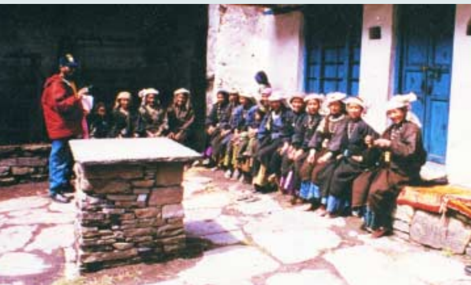
FIGURE 4 A women's self-help group analyzes the impacts of the Reserve on their lifestyles and perceptions.

and produce due to wildlife depredation (13%). While women (constituting about 10% of those surveyed; see Figure 4) gave loss of subsistence needs as the primary reason (100%), most male respondents (60%) cited loss of economic opportunities (Table 1).