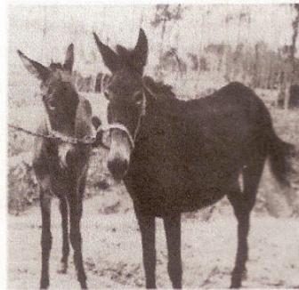
Figure 1. The foal (aged 1½ years) with its mule mother

Reports of fertility in mules and hinnies: There have been several reports of hinnies and mules having foals. A hinny stallion imported from Texas in the late 60's was reported to produce live and mature spermatozoa's (Trujillo et al. 1969). However, there was much controversy over the fertile animal but it's possible. Another case of a fertile mule in China during the late 80's later turned out to be a fertile hinny that produced a live foal named Dragon Foal (Rong et al. , 1985, see Figure 5). Figure 6 refers to the schematics and genetics of hinnies and mules that produce live foals and if they are mated with a horse or jack and what the outcome would be. More and likely there are more fertile mules and hinnies than we know of but most people do not attempt to breed them. Depending on where they are born and the beliefs associated with mules and hinnies having foals there's probably more live foals born in developing countries than we know of. In some cases the live foal of a mule or hinny maybe seen or considered a blessing and in other cases a curse. Recent reports of live foals from mules have come from Colorado and Morocco. Some horse breeders are now using mules as recipient mares/mothers to carry horse foals due to their outstanding mothering abilities.