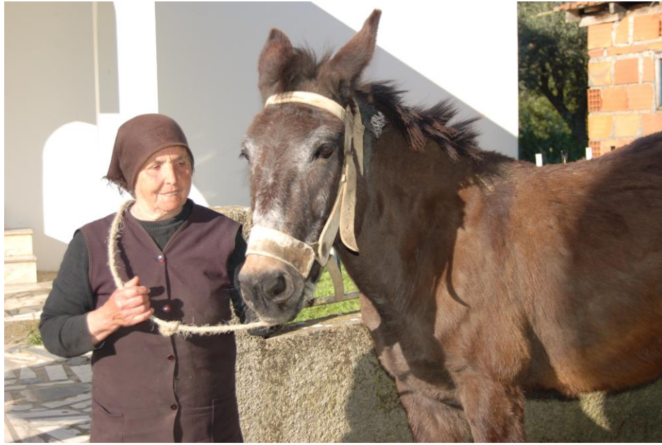
Figure 2. A hinny from Miranda, Portugal an area where there are many hinnies used in the communities for ploughing potatoes and helping harvest grapes. Although, most of the hinnies are quite old averaging 24.3 + years and soon there will be less hinnies in this area and less people using hinnies.

In Baja, Mexico cattle ranchers prefer hinnies to mules due to the very rough and desert type terrain. The ranchers believe that hinnies perform and work better in this dry, desert climate and can withstand longer periods without water compared to a mule. This attribute more closely resembles characteristics of a donkey versus a horse (Corazon Vaquero, 2008). Other places like Portugal, Colombia, and Mexico, hinnies are found based on the availability of female donkeys and mares. In some communities it's easier to find mares to breed with jacks (male donkeys) and some times in more resource poor communities donkeys may only be available, therefore, a female donkey is then mated with a stallion to produce a hinny. In some cases the hinny has even been referred to as the "poor man's mule."