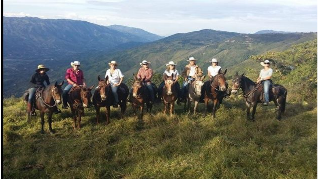
Figure 10. Paso Fino mules and hinny from Criadero Villaluz Farm in Colombia. These equids are used for showing, trail riding and helping harvest sugar cane. Blood chemistry and conformation samples were collected from all of these equids that are all closely related. Breeders such as these will continue to help inspire researchers to collect data on mules and hinnies to learn even more about them.

two hybrid crosses. Baseline values for mules and hinnies are invaluable veterinary science information for those involved in management and disease diagnostics (McLean and Wang, 2013, McLean et al. , 2014). Overall, mules and hinnies have many fallacies to overcome but with continued interest from non-governmental organizations working with working equids abroad and breeders continuing to produce mules and hinnies for recreation and performance purposes, hopefully, research will continue to focus on learning more about the behaviour, anatomical and physiological commonalities and differences of these unique creatures (Figure 10) to decrease the deficit in knowledge about an animal that has served mankind for thousands of years.