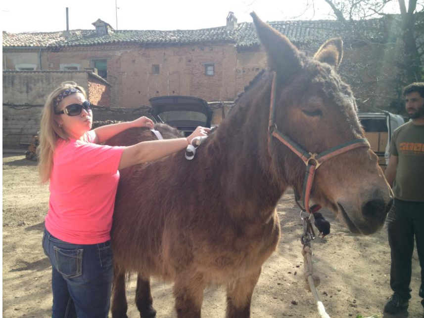
Figure 7. Measuring the length of the back of a hinny in Toro, Spain. The idea is that the equine can be divided into 3 equal parts and they are then considered to be balanced because the length of the poll to wither equals the length of the back and the length of the hip. We have found in mules, hinnies and donkeys that the length of the neck and back are often close but the hip falls short.

will generally be the same but the hips in all three equids (mule, hinny and donkey) is much shorter than what we would find in a horse. When we look at balance by measuring the top to bottom ratio, the underline (the area behind the elbow to the flank) compared to the topline (the top of the withers to top of the hip) we find in horses that a balanced horse will have a 2:1 ratio (underline is twice as long as the back or topline) but in a well balanced mule or hinny we have found this ratio to be 1:1 (refer to figure 7).