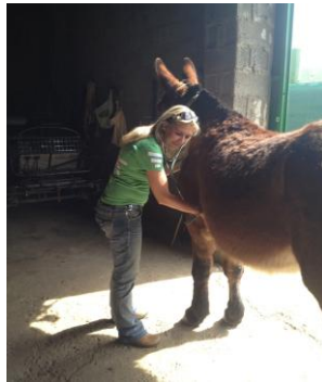
Figure 8. Taking the heart rate of a hinny in Toro, Spain. There's a significant difference found when comparing the heart rate of hinnies, mules, donkeys and horses in Spain and Portugal.

The populations of mules and hinnies used in the second study that's represented in tables 1, 2 and 3 were unique considering that they came from similar breeds of horses and donkeys (Spanish or Portuguese, such as the Zamorano-Leonés or Mirandês donkeys or middleweight Iberian type horse) used for both mule and hinny production, the ascendancy of each one of the hybrids was perfectly know and the hybrids were all located in the same geographical area in a healthy status. However, the population of hinnies was also significantly older than the other equid groups due to the fact that the owners of the hinnies were also aging and there was no renewed interest in breeding hinnies for draught purposes. The most recent study conducted in Colombia was also unique in the fact the animals were all of similar Paso Fino genetics and in some cases we have sampled the dam, sire, and multiple brother and sister pairs. This group of animals was also all managed under the same direction. Having such homogeneity in a population of animals is more ideal when testing for blood chemistry or conducted such studies for reference values due to previous differences in climate, management, and nutrition, genetics that may affect the outcome of blood profiles.