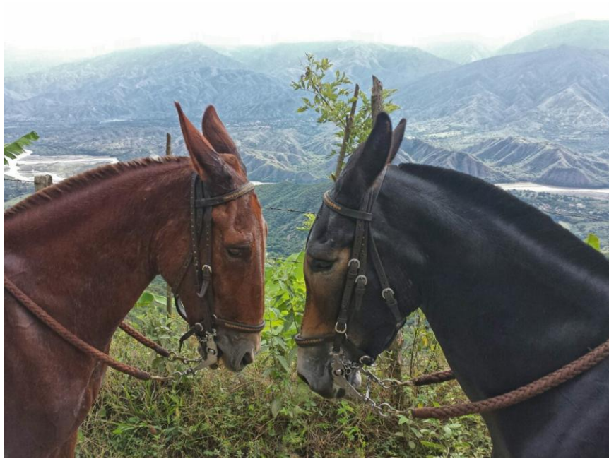
Figure 1. Mules and hinnies comparing the commonalities and differences of these hybrids to their parents the donkey and horse. One of the most challenging things to do is distinguish a hinny from a mule based only on its appearance. Which is the mule and which is the hinny in this figure?