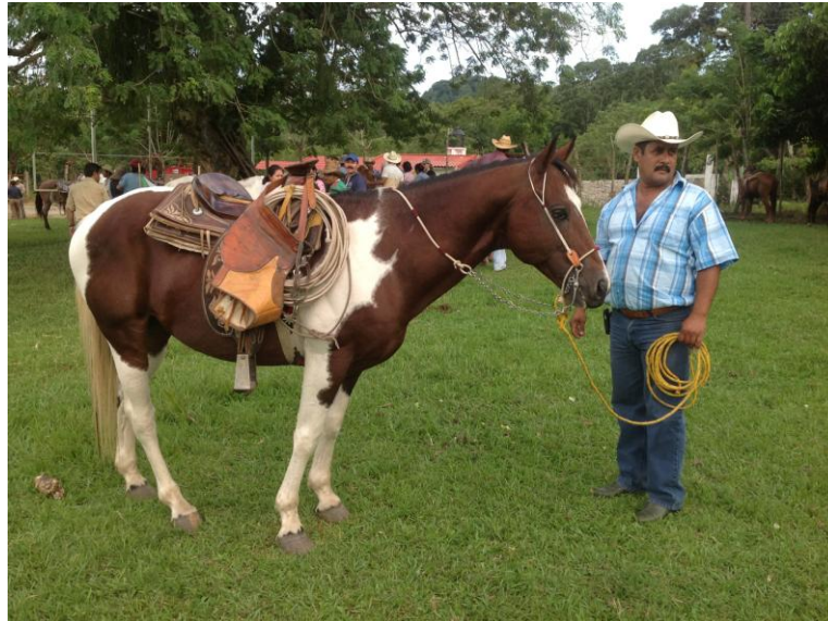
Figure 4. A stallion in the state of Veracruz, Mexico used for breeding to jennies (female donkeys) for hinny production.

Breeding for mules and hinnies: Hinny breeders in many countries have all shared challenges with raising hinnies. One such challenge is convincing a stallion to breed a female donkey but the same can be true when asking a jack to breed a mare horse. Some breeders have even begun using artificial insemination and to improve the size and quality of hinnies being produced. In Colombia like in the US, the perception has generally been that hinnies are smaller and somewhat inferior to mules. However, some breeders have started using artificial insemination and using semen for example from champion Paso Fino horses to produce outstanding hinnies to prove there's little to no difference in size or quality when producing hinnies. However, some breeders have also reported difficulties in getting jennies to settle or conceive when breed to a horse. Several theories have been proposed that the decreased conception rates are due to acrosomal differences on the acrosome of the spermatozoa of the stallion compared to the donkey and other theories have been based on ideas that the intrauterine environment is somewhat different in a jenny compared to a mare. Generally, once a stallion is found to breed jennies and produce live foals, that stallion will continue to be used for hinny production (refer to Figure 4).