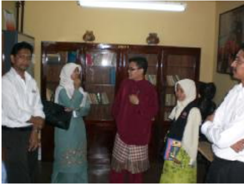
Students visiting the Malay Resource Centre at Padang.