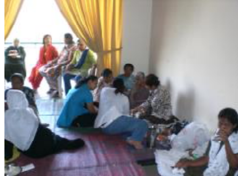
Members enjoying the lunch.

A CEREMONY TO CIRCUMCISE POOR MUSLIM BOYS OF THE AREA WAS CONDUCTED ON 14 TH DEC 2008 AT PADANG.