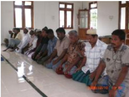
Prayers in progress at the newly Constructed Kirinda Mosque