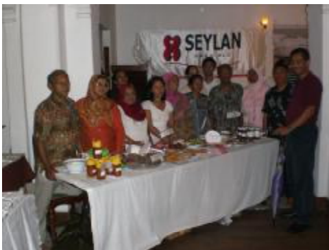
The Malay Food stall run by the members Of Kandy Malay Association.