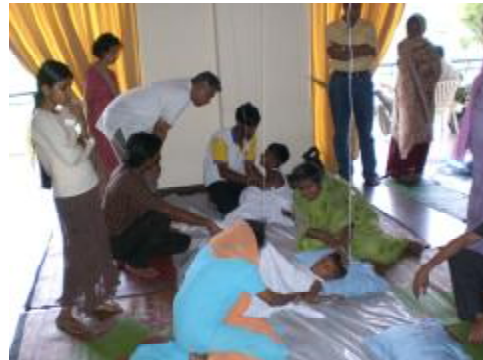
President of CMCC consoling.