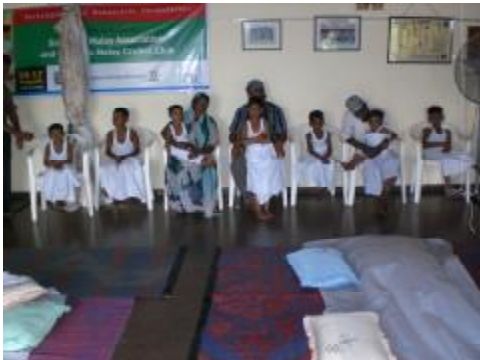
The boys awaiting their turn

A CEREMONY TO CIRCUMCISE POOR MUSLIM BOYS OF THE AREA WAS CONDUCTED ON 14 TH DEC 2008 AT PADANG.