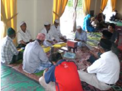
Recital being carried out.

THE ANNUAL RECITAL OF KATHAMUL QURAN IN MEMORY OF MALAY SOLDIERS WHO HAVE DIED IN THE WAR, MEMBERS OF CMCC/SLMA WHO HAVE PASSED AWAY AND VICTIMS OF THE TSUNAMI WAS HELD AT PADANG ON 14 TH DEC 2008.