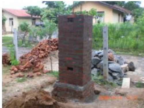
Construction of the Madarasa.