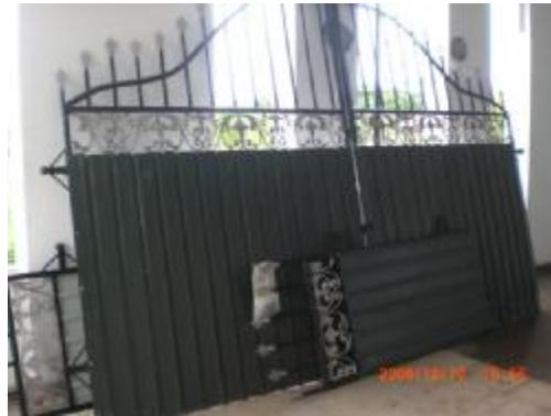
Gates for the Kirinda Mosque which was also constructed from donations Received from well wishers.