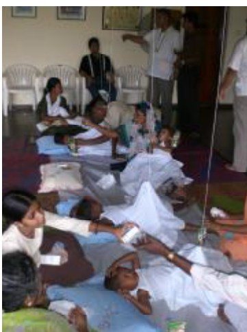
The boys after the circumcision