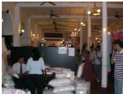
The Trade stalls having good sales.