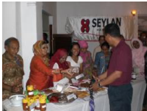
Ladies of KMA trying to convince SLMA President to purchase Malay Dodol, Acchar, and other Malay delicacies.