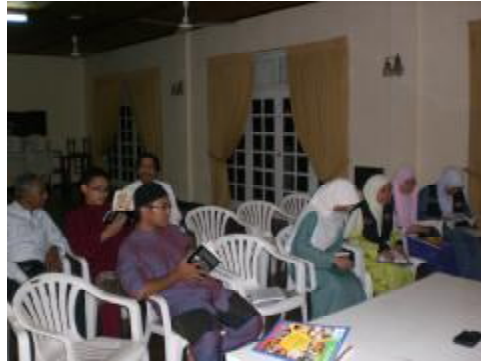
Students going through the Orang Regimen Book and the Malay Rally 2008 Souvenir.