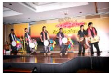
"Fusion Drums" – a drumming routine