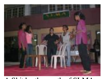
A Skit by the youth of SLMA