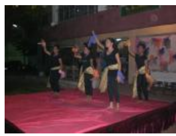
Dance item performed by SLMA Dance troupe