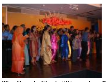
The Grande Finale "Sing-a-long"