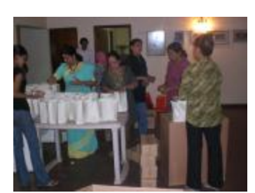
Members of the committee packing the Gift packs.