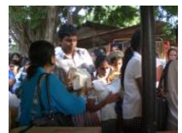
Distribution of gift packs to the Children of the Cancer hospital paedeatric ward.