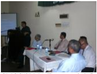
CMCC/SLMA Treasurer briefing the participants on the adoption of proper financial reporting.