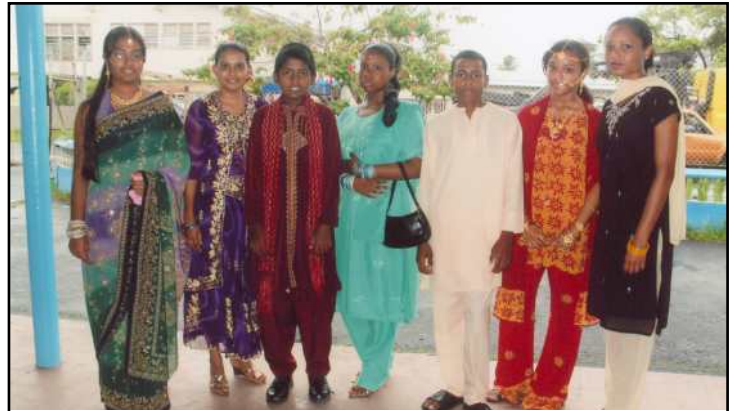
Students display East Indian wear during the festivities.