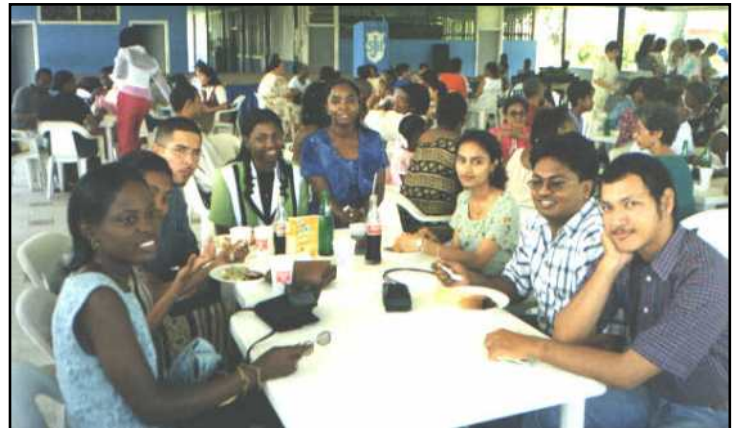
Alumni at the Sunday Brunch during Reunion 2000 in Georgetown.

According to the Organizing Committee a confirmed itinerary complete with venues will be unveiled in January 2009 at the official launching ceremony.