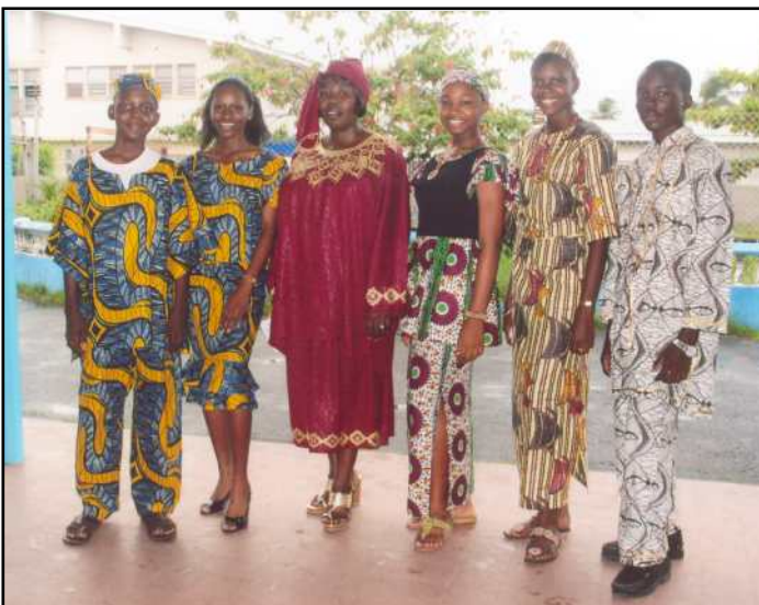
Students and a teacher adorned in African outfits during the St. Joseph High Cultural Day festivities.