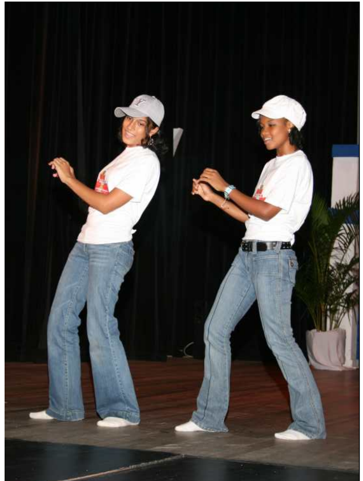
A part of a group of Sjh students who gave a raving "Stomp" performance at the Talent Extravaganza, much to the delight of the audience.

8:00pm and from then on it was non-stop entertainment with patrons being entertained for the first half hour by excellent renditions of songs and well choreographed dances by some of St Joseph finest. Worthy of mention, and not that the others aren't, was a group calling themselves 'Steps', who transformed stamping of the feet into a form of dance that truly had the crowd wowed. By the time patrons were beginning to get a bit bored with all the