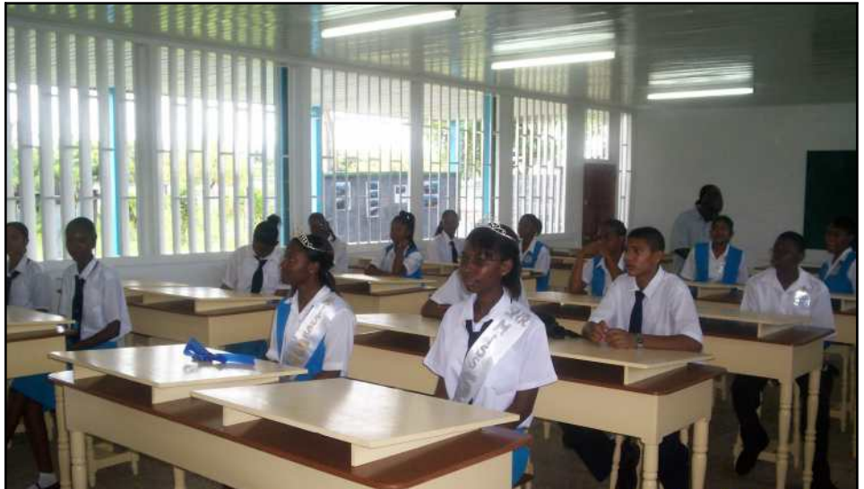
Students occupying the newly refurbished Technical Drawing Laboratory

also benefited from a donation of kitchen utensils by the Canadian Chapter.