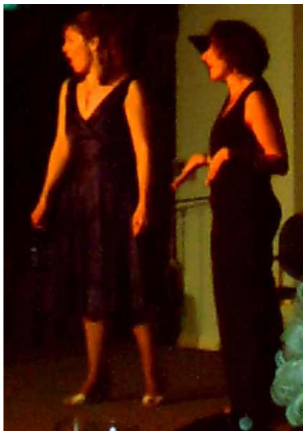
I know him so well

Songs from 'Annie', 'Fiddler on the Roof', 'The Lion King', 'Phantom of the Opera' and 'Chess' followed.