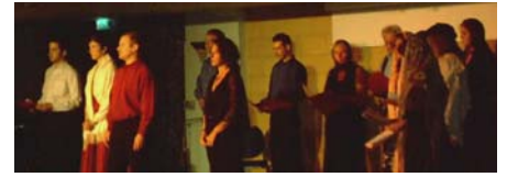
One day more

The finale was an emotional medley from 'Les Miserables'.