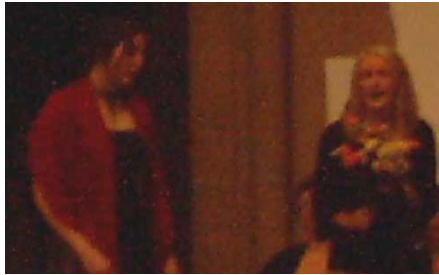
The Cat Duet