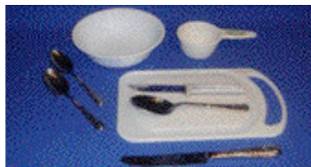
BOWL, MEASURING CUPS, KNIVES, SPOONS, CUTTING BOARD