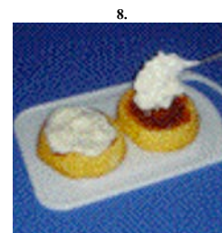
8. SPREAD COOL WHIP MIXTURE ON SECOND SPONGE CAKE □