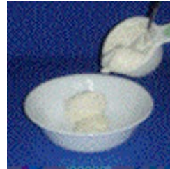
2. BLEND COOL WHIP INTO CREAM CHEESE □