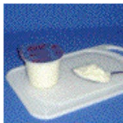
VANILLA JELL-O PUDDING