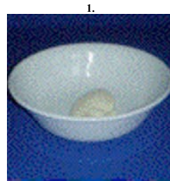
1. PUT SOFT CREAM CHEESE INTO BOWL □