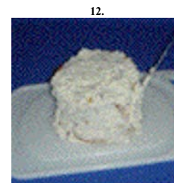
12. SPREAD REMAINING COOL WHIP MIXTURE ACROSS TOP AND SIDES □