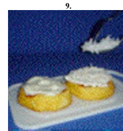
9. SPRINKLE SPONGE CAKES WITH SHREDDED COCONUT □