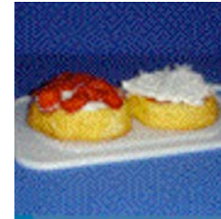
10. ADD A FEW STRAWBERRIES TO LAYER OF PUDDING □