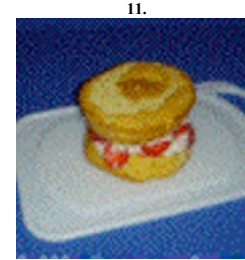
11. PLACE SPONGE CAKES TOGETHER WITH FILLINGS INSIDE □