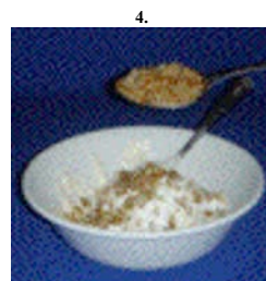
4. STIR IN FINELY CHOPPED PECANS □