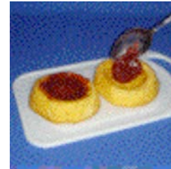
6. SPREAD INDENTATION OF EACH SPONGE CAKE WITH STRAWBERRY PRESERVES □