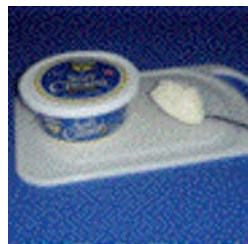
SOFT CREAM CHEESE