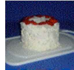
14. DECORATE CAKE WITH REMAINING STRAWBERRIES