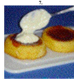
7. SPREAD JELL-O PUDDING ON ONE SPONGE CAKE □