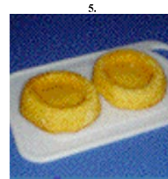
5. PLACE SPONGE CAKES WITH INDENTATIONS FACING UP □