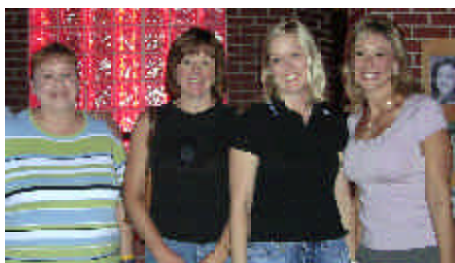
Sisters gathered for fun and games at Dave & Busters after a month of hurricanes.

July brought us together for our first ever bowling night at Bowl America in Mandarin. Spares, Strikes along with lots of fun and laughter were had by all.