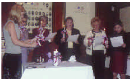
Founder's Day ceremony.