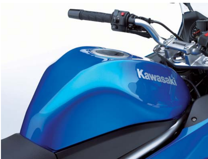
Candy Plasma Blue