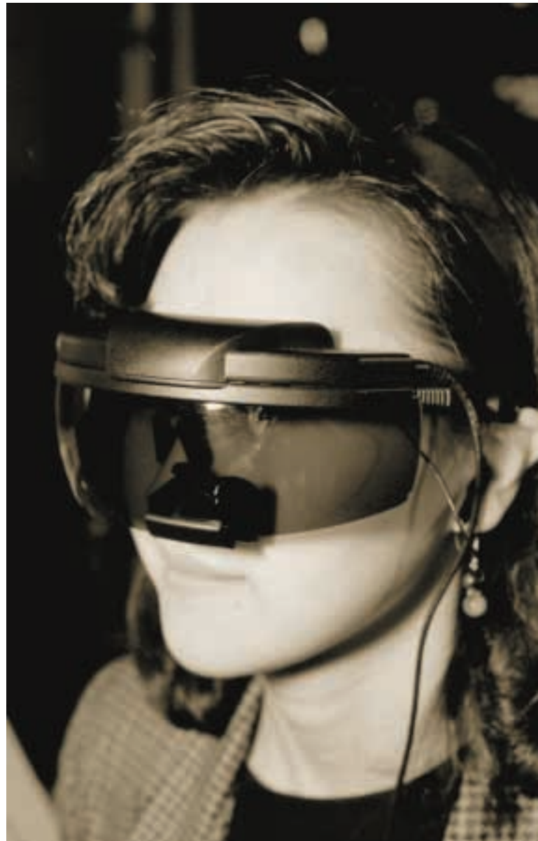
Testers identify problems in a video game before it is released to the public.

a game level that won’t load. Other problems are with gameplay. “If you spend two hours getting past a monster and only earn two points, there’s something wrong,” says Nelson. Testers identify places that are too hard, too easy, or too confusing.