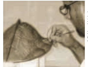
Some artists sculpt models for 3-D scanning.

Animators create two kinds of action sequences: cut scenes, the short movies that play at predetermined times in the game, and player-controlled action, such as running, jumping, or talking. During cut scenes, animators can make the action as detailed and complicated as they'd like. But when the player is in control, the animator is more constrained: the player must be able to produce most movements with a joystick, button, or menu selection.