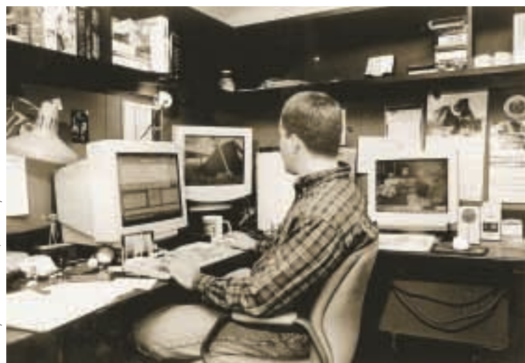
Developing strong math skills helps programmers describe a video game object’s movement through space.