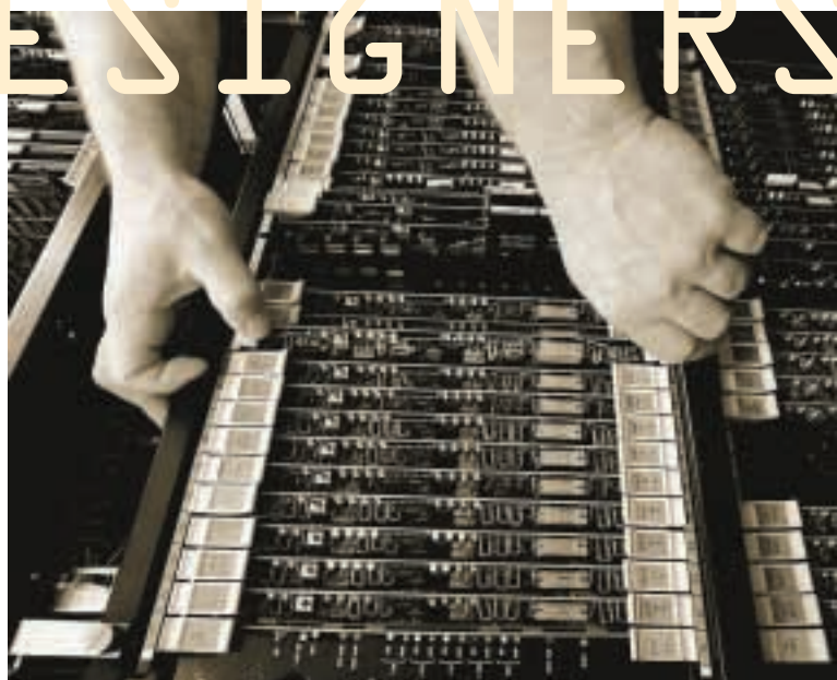
To create sound effects, sound designers modify an existing noise or find and record it themselves.

They balance realism with the entertainment value of exaggeration, routinely sweetening natural sounds for dramatic effect.