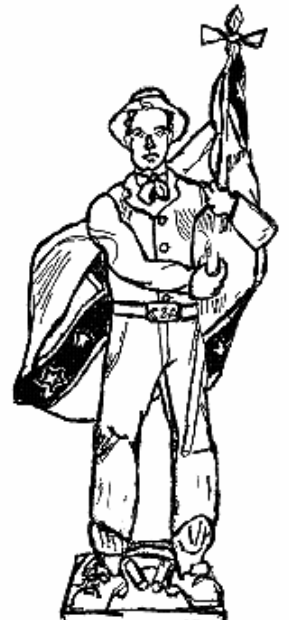
The South's Defenders