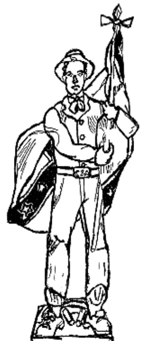
The South's Defenders