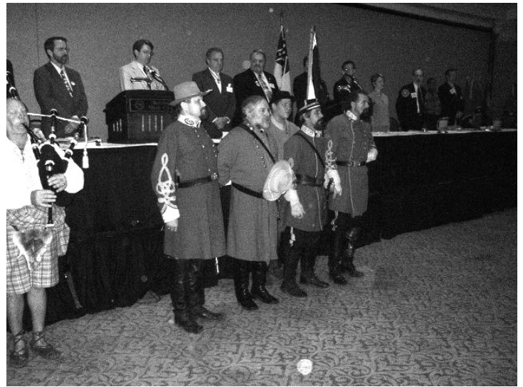
Opening ceremony at the SCV Convention in Nashville, showing reenactors portraying famous Confederate generals, from left, Gen. Joseph Shelby, Gen. Robert E. Lee, Gen. Patrick Cleburne and Gen. Nathan Bedford Forrest.