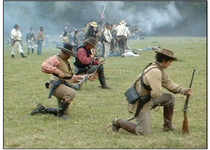
Confederate skirmishers at the Pleasant Hill reenactment.

CWPT is a 70,000-member nonprofit battlefield preservation organization. Its mission is to preserve our nation’s endangered Civil War sites. CWPT has saved 21,300 acres of hallowed ground, including 342 acres on the Gettysburg Battlefield. CWPT’s website is located at www.civilwar.org .