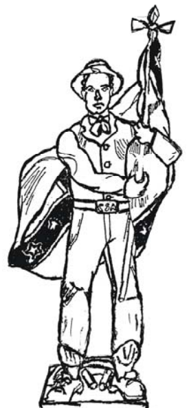
The South's Defenders