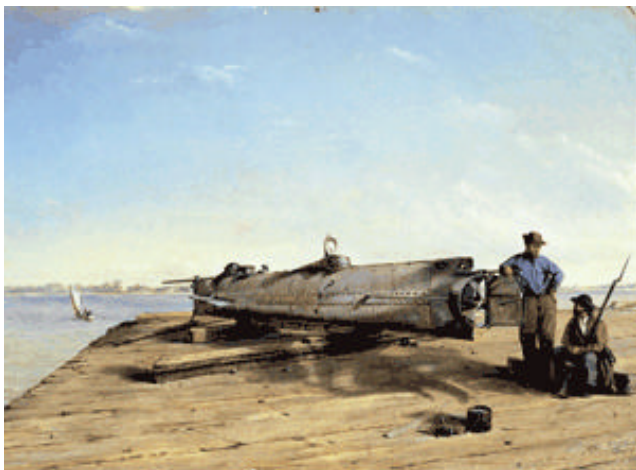
Painting by Conrad Wise Chapman, circa 1865.

Admission prices are $4.00 for adults, $2.00 for students and children under 6, free. We will have food vendors and sutlers on site.