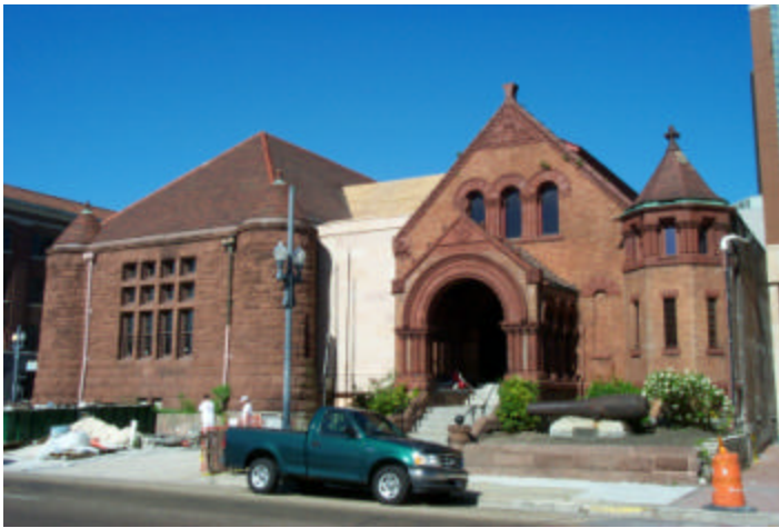
This photo shows Memorial Hall Confederate Museum in New Orleans, attached to the Ogden Art Museum, with construction in progress.